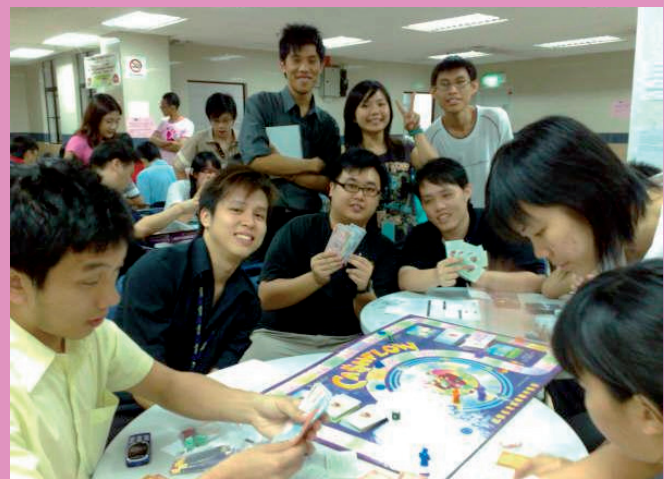
The students having fun at the board game competition.