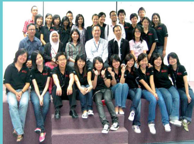
The happy faces of the interns during the closing ceremony.