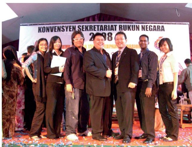
UTAR SRC members at the convention.