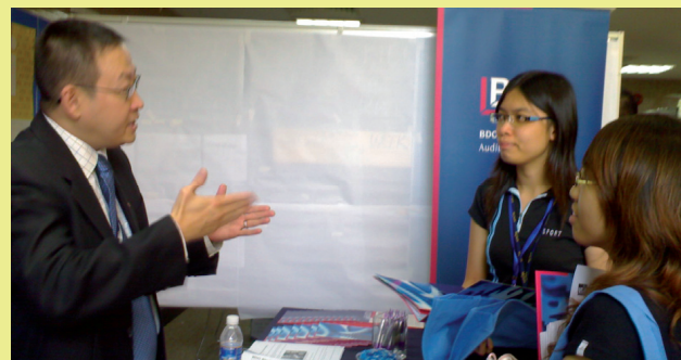
Students seeking career advice during Career Day.

Apart from career counselling, career talks were also held. Some of talks were conducted by speakers who are professionals from various bodies and organizations. Personal financial management, interview skills, accounting career prospects, and resume writing were some of the subjects of the talks.