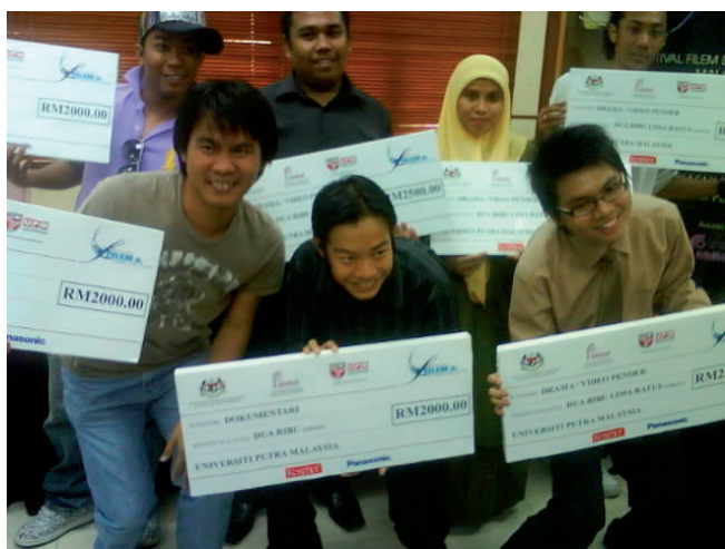
Happy winners with their prizes at the Festival.

The production of both the teams from UTAR will be aired in UPM during the three-day Festival from 8-10 January 2009. At the Festival, the teams' entries will stand a chance to win awards and/or prizes from the Anugerah Perdana . Results of the Anugerah Perdana will be announced on the final day of the Festival.