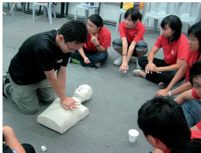
A participant practising giving CPR during the training.