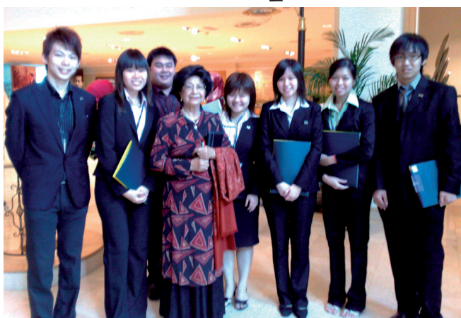
UTAR delegates take the opportunity to pose for a photo with Tun Dr. Siti Hasmah, wife of former Prime Minister Tun Dr. Mahathir Mohammed.