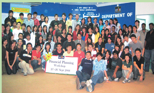
Participants at the Financial Planning Workshop.

At the end of the workshop, the participants were reminded to start applying the knowledge they had gained in helping them improve their financial management and budgeting.