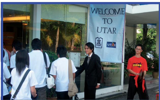
Welcoming THHS students.