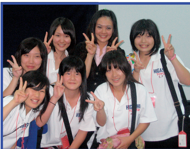
THHT students peace gesture.

UTAR and the Student Representative Committee (SRC) organised a Cultural Exchange Programme for the visiting Toyota Higashi High School (THHS), Japan on 15 October 2008 at the Petaling Jaya Campus.