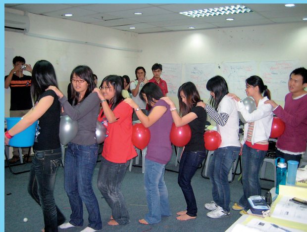
Teamwork: One of the activities during the Workshop

Despite being on semester break, UTAR students can still enrich their academic experience through courses organised by the UTAR's Department of Soft Skills Competency (DSSC). From 3 – 10 October 2008, DSSC organised the Interpersonal and Personal Development Workshop at the Petaling Jaya Campus.