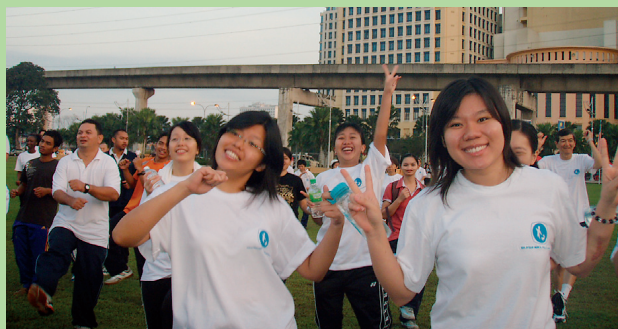
UTAR participants warming up.

Before their departure from the event, they were each given goody bags and free drinks in appreciation for their support for the Big Walk.