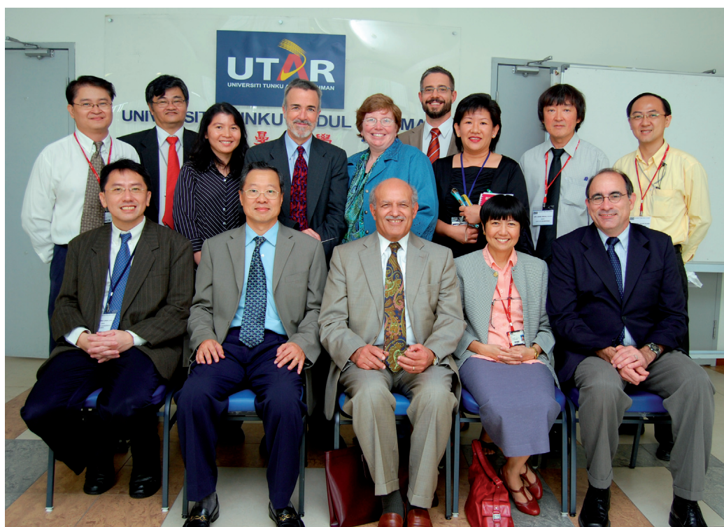
UTAR senior officials posing with the visitors from Lehigh University.

UTAR opened its doors to five senior officials from Lehigh University, USA who visited UTAR Kuala Lumpur Campus for a one-day visit on 30 October 2008.