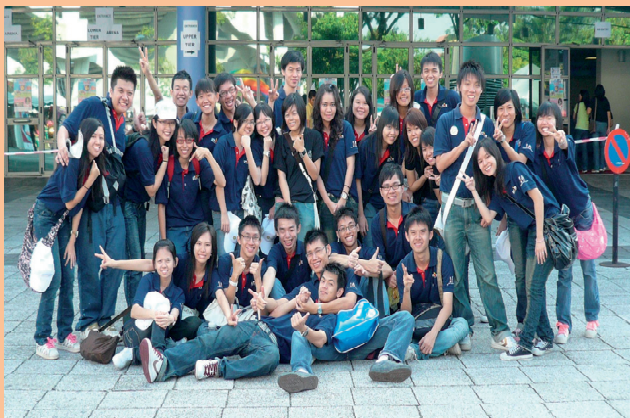
UTAR delegates enjoying themselves at WUSA.