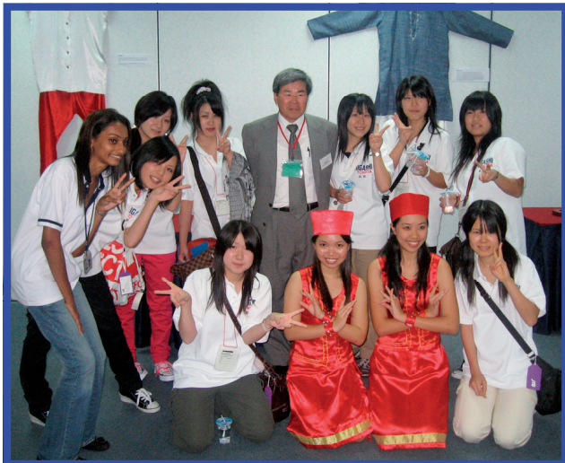
THHS students with UTAR students.

The visitors then were given a rousing send-off after the photo-taking session and gift exchange.