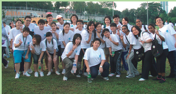
Participants from UTAR.