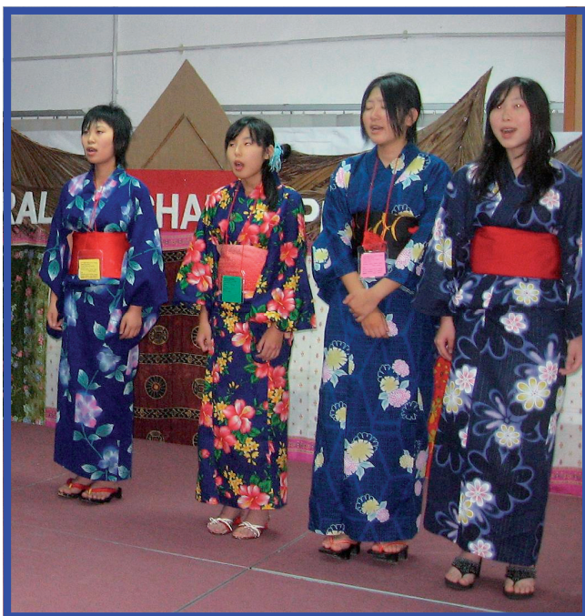
THHS students performing during the Cultural Exchange programme.