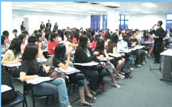
Participants listening attentively during the Workshop.

Some 90 members from the UTAR Career Development Society gained beneficial insights that could help them in securing their dream jobs during the 'Resume Writing and Interview Workshop' held on 22 October 2008 at the Bandar Sungai Long Campus.