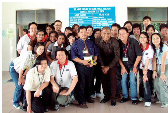
Students who participated in the visit pose for a photo before leaving.

Upon their arrival at the hospital, the students were introduced to the history and functions of the hospital as well as the facilities available at the hospital. They were also briefed on the activities undertaken by the hospital residents such as the