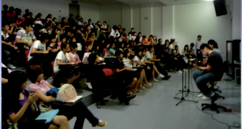
The singers performing to a large crowd.