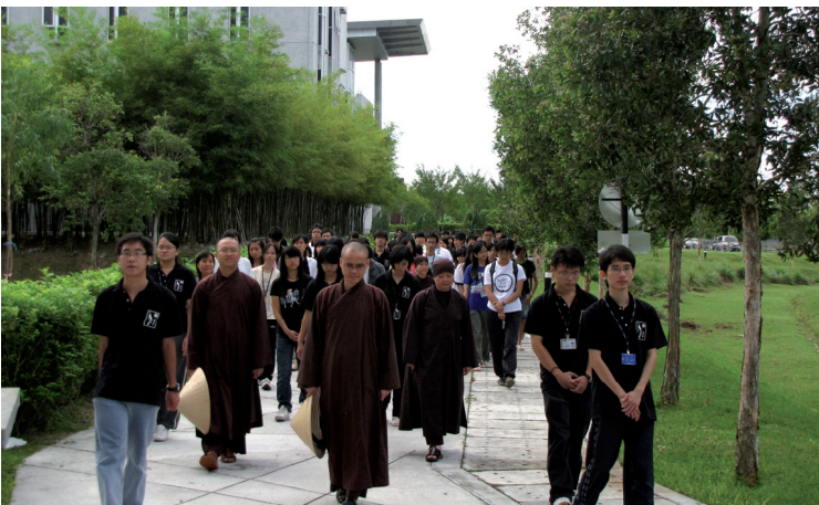
Walking meditation led by the master.