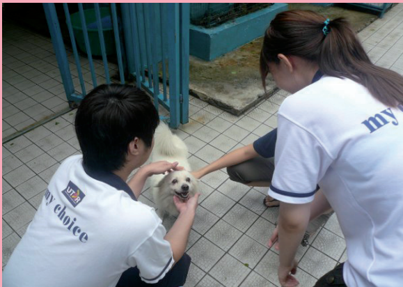
Students cultivate a love for all animals at SPCA.

The UTAR Community Service Society paid a visit to the Society for the Prevention of Cruelty Towards Animal (SPCA) in Ampang, Selangor on 21 November 2009. The UTAR visitors arrived in the morning, and upon arrival, they were taken on a tour of the premises. This SPCA care centre is divided into three sections, namely the area