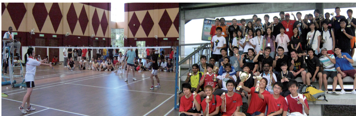
(Left) The women's badminton event in full swing; (right) Happy cheer from team Perak Campus, the overall champions.