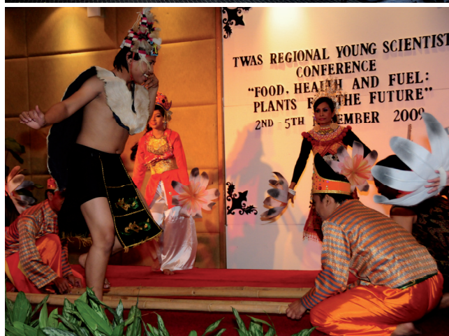
( Top and bottom ): The cultural diversity of Malaysia was shown in the performance during the dinner function.