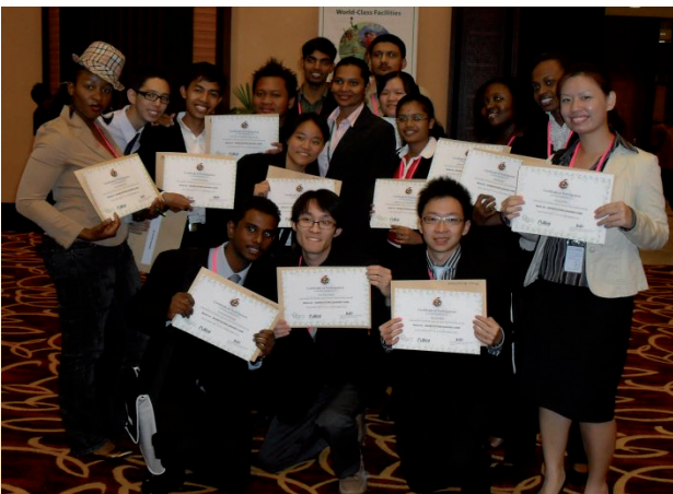
Valuable experience: The student leaders proudly showing off their certificates after the Camp.

Five members of the UTAR Student Representative Council (SRC) participated in the Nilai University College-Ministry of Higher Education (NUC-MOHE) Future Leaders Camp 2009 held at a resort in Negeri Sembilan from 7 – 9 November 2009.