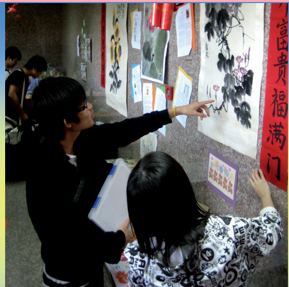
Students admiring one of the works of art on display.

Visitors on the last day of the exhibition also participated in a lucky draw held in conjunction with the exhibition.