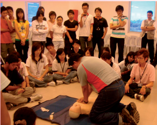
Students shown the correct method of applying CPR.