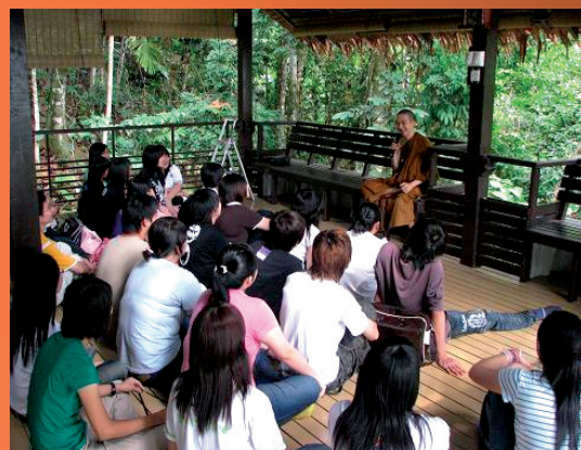
众人细心聆听Venerable Kumara Bikkhu法师的话。