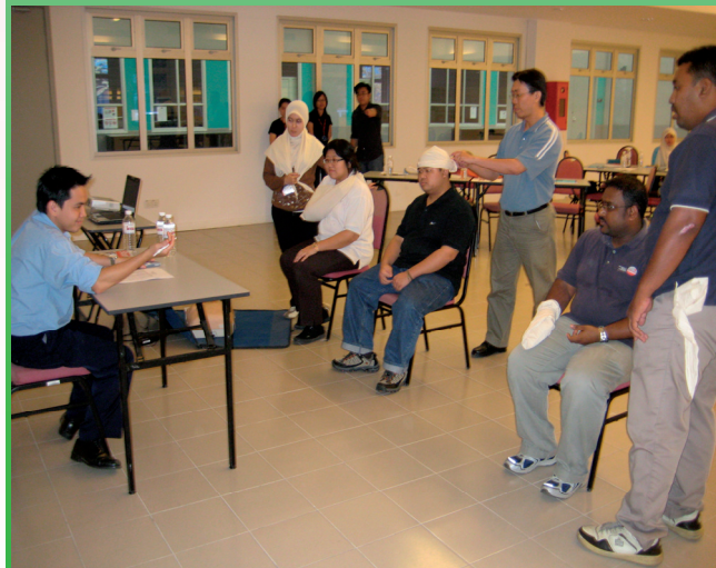
UTAR staff undergoing their practical test at the training.

Many of the participants shared the common view that helping others in time of need was rewarding and the time and effort spent learning first aid skills was worth it.