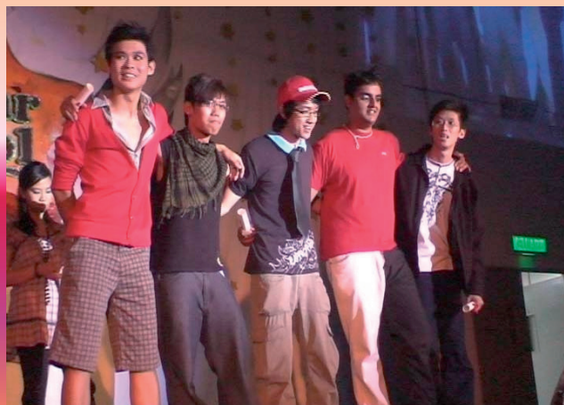
The five finalists waiting nervously for the result.