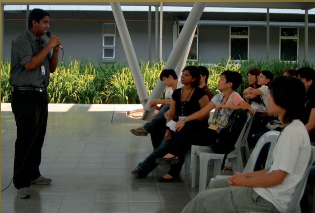
A speaker expressing his views.