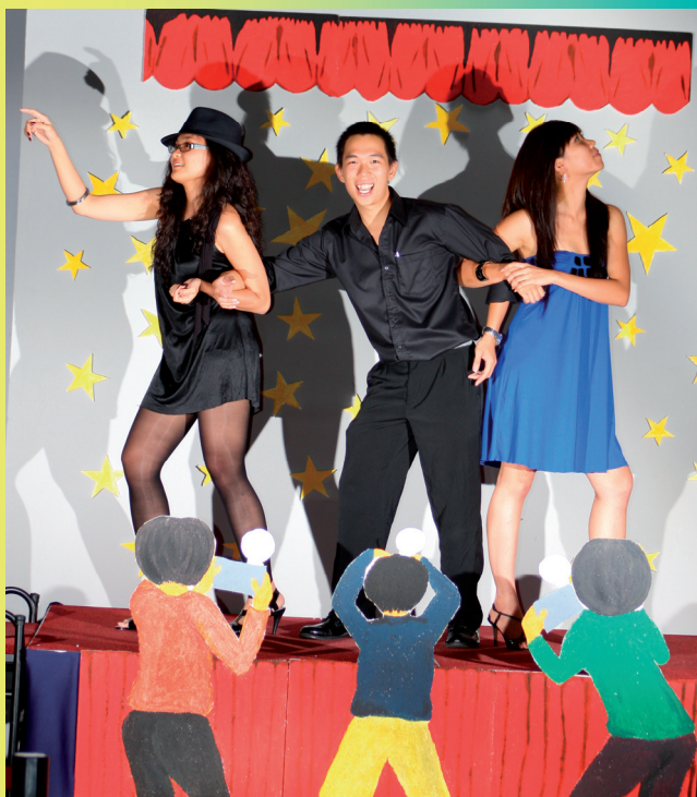
Experiencing "Hollywood glamour" at the prom.