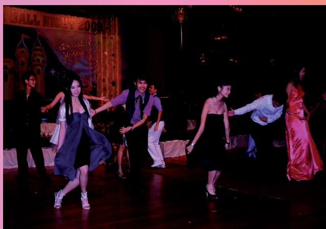
Students performing at the Ball.

The night ended with the ball dance where students let their hair down and grooved to the music, and had a great time with their friends.