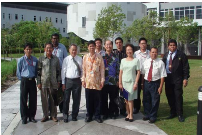
Delegates from IKM with UTAR staff at Perak Campus.