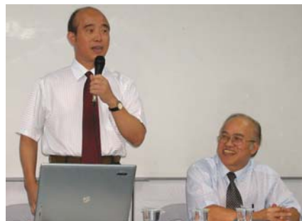
庄教授(左)解说华人史研究在中国的发展。旁为主持人林水椽教授。

他国家,中国的华人华侨研究具有超越一般学术价值的特殊性,尤其对中国发展的历史作用而言。他也表示,华人华侨迄今仍是中国最重要的海外资源和民族复兴主力。他也点出华人史研究如今面对的问题。以厦门大学南洋研究院为例,由于训练和水平不足,同时缺乏系统的理论培训,对国际研究和理论前沿的把握,南洋研究院面对创新能力低弱、文献单薄等问题。研究者治学态度恶劣、急功近利则是更重要的因素。他总结时表示,中国的华人史研究规模很大,但水平仍不足。