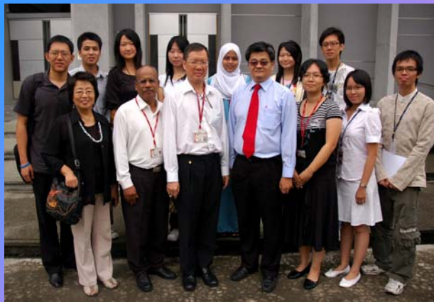
The visiting students from BFSU with UTAR officials.

Beijing Foreign Studies University is China's most prestigious school for the study of Language and is one of the key universities directly affiliated with the Department of Education China.