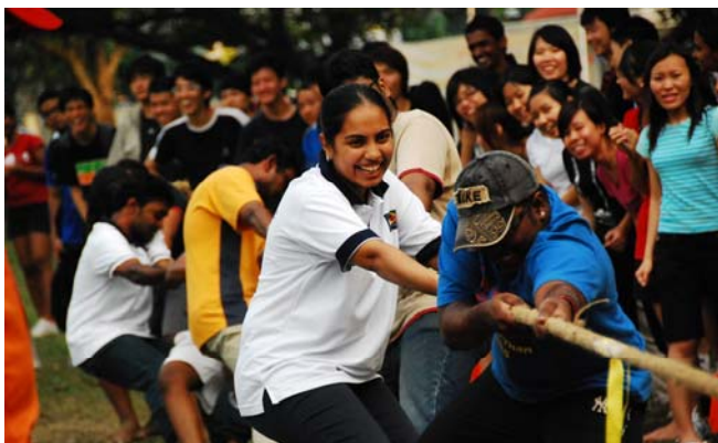
Pull...pull...pull... UTAR staff and students...having lots of fun.

The dexterity, swiftness, accuracy and physical power of some 700 UTAR students were put to the test at the UTAR Sports Carnival 2009 on 2 August 2009. The carnivals held concurrently at Kolej Tunku Abdul Rahman (KTAR) sports facilities in Kuala Lumpur and UTAR Perak Campus in Kampar comprised different teams competing in different categories.