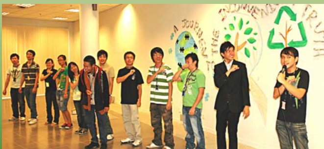
Enthusiastic students have a great time at the workshop.

"White Coffin refers to the polystyrene food containers that are so heavily used nowadays. They comprise benzene, styrene, ethylene and blowing agent.