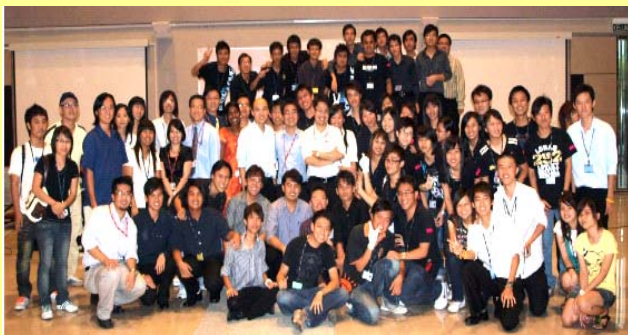
Lecturers and students had a great time bonding.