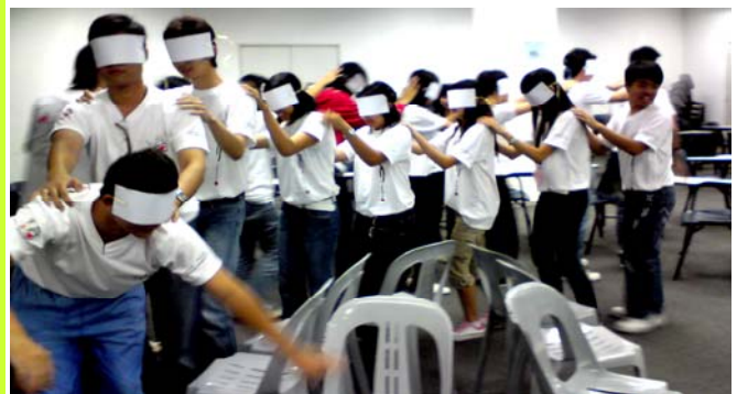
Top: Team-building activity held during the camp. Bottom: The happy faces of camp participants.

A similar event, this time called the 30-Hour Famine August 2009 was also held at the Petaling Jaya Campus on 22 - 23 August 2009.