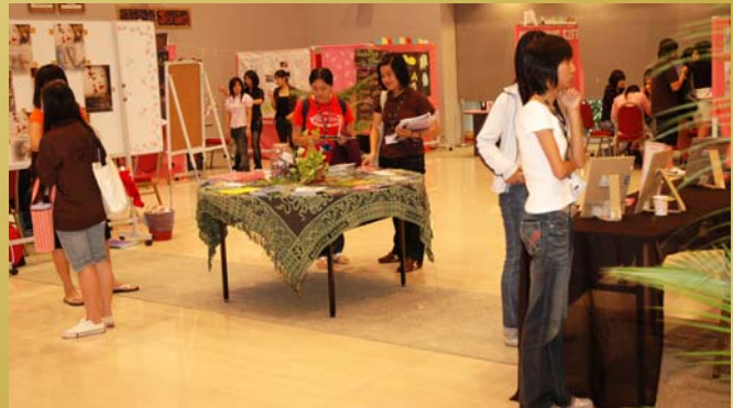
Students viewing exhibits of the exhibition.