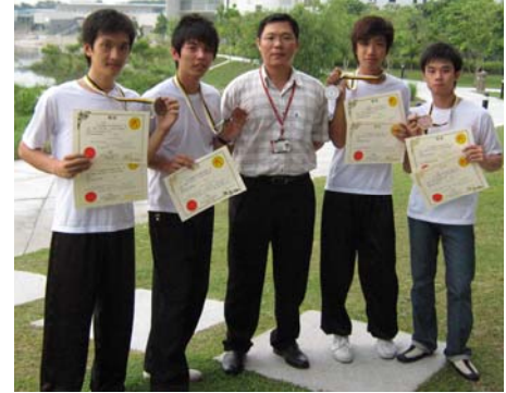
UTAR wushu exponents displaying their medals.