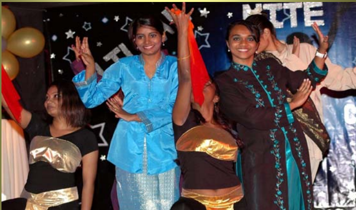
Cultural performances by UTAR students.