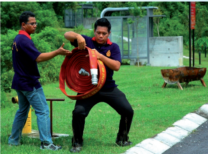
UTAR staff practising the proper methods to lift the fire hose.