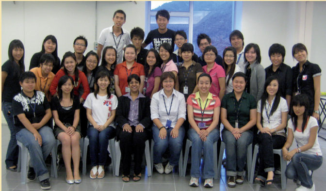
Participants with the trainers.

In today's world, the path to corporate success is very complex. The emphasis in this age of a knowledge economy is to seek knowledge workers who are multi-skilled and versatile. Some 30 final year students took the opportunity to hone their employability skills to enable them to hit the ground running when stepping into the challenging k-economy. Sponsored by MSC Malaysia's Knowledge Development Initiatives, the 10-day MSC Malaysia Undergraduate Skills Programme (USP) was held from 17 – 26 May 2010 at UTAR Perak Campus.