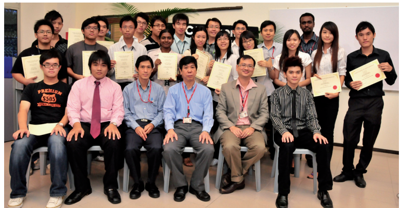
Award winners with FEGT staff.

The showcase of building models attracted the attention of many students who were also seen enjoying themselves in exciting and challenging competitions such as Housing the Egg and Paper Tower Construction.