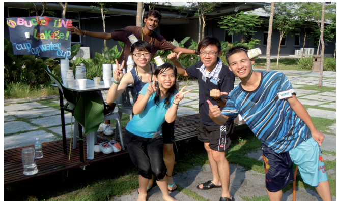
Students playing the bucket line game.