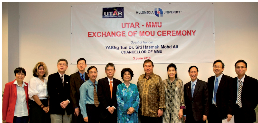
Senior officials of UTAR and MMU with Tun Dr. Siti Hasmah, Tun Dr. Ling Liong Sik and Toh Puan Ena Ling.

Universiti Tunku Abdul Rahman (UTAR) and Multimedia University (MMU) achieved another milestone in their inter-institutional collaboration efforts when both parties marked their alliance with a document exchange ceremony held at UTAR Perak Campus in Kampar on 3 June 2010.