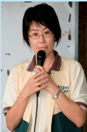
Ooi from NKF giving a talk to UTARians.

According to Ooi, CKD patients could lead a normal life by taking medication, if the problem was detected during the early stages. If not, they had no option but to go for dialysis at least three to four times a week. It could cost up to RM250 per session. She added, "The only way to reduce the possibility of CKD is by watching what you eat and to go for medical check-ups at least once a year."