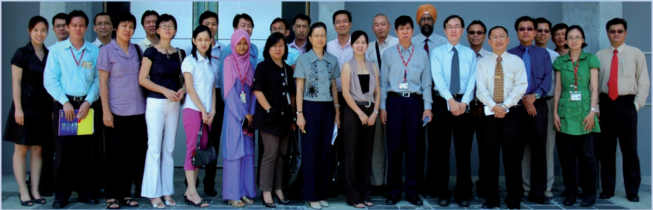
FMM members with UTAR staff.

Recognising academia-industry collaborations as an integral component underpinning the University's relevance to industry, UTAR and Federation of Malaysian Manufacturers (FMM Perak) jointly organised a meeting on 26 May 2010.