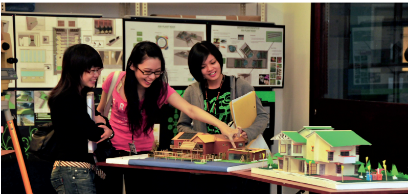
Students admiring the building models at the exhibition.

It was a hive of activity at the Faculty of Engineering and Green Technology (FEGT) at UTAR Perak Campus when the Built Environment Society organised the Construction Management Open Day on 16 June 2010.