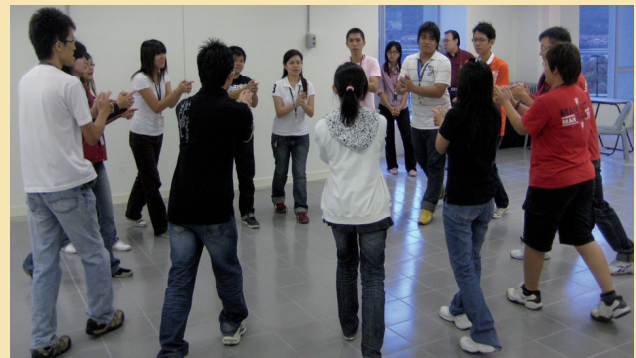
Team building activities.