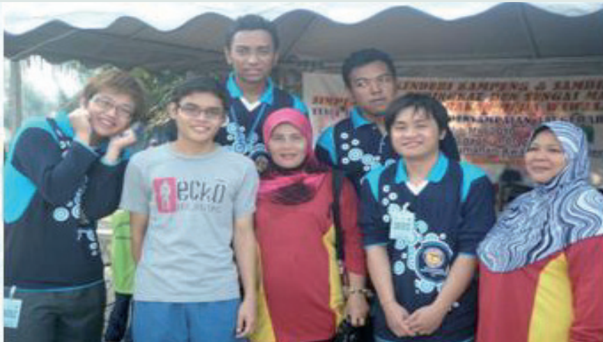
Some students with their foster families.

The students enjoyed themselves thoroughly and found that adjusting to the new surroundings was easy due to the warm hospitality of the villagers. All of them had an unforgettable experience living in Kampung Chenderong Balai and that opportunity enabled them to better understand a different way of life.