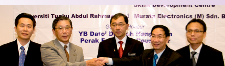
UTAR signs pacts with PESDC and Murata >p2