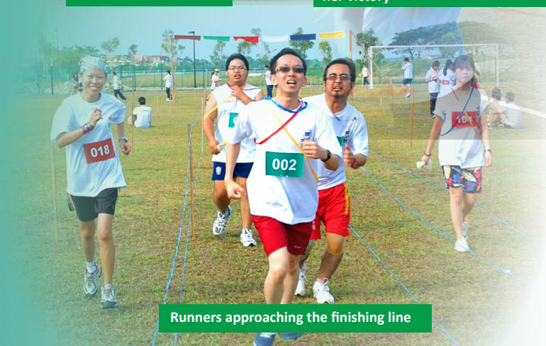
Runners approaching the finishing line