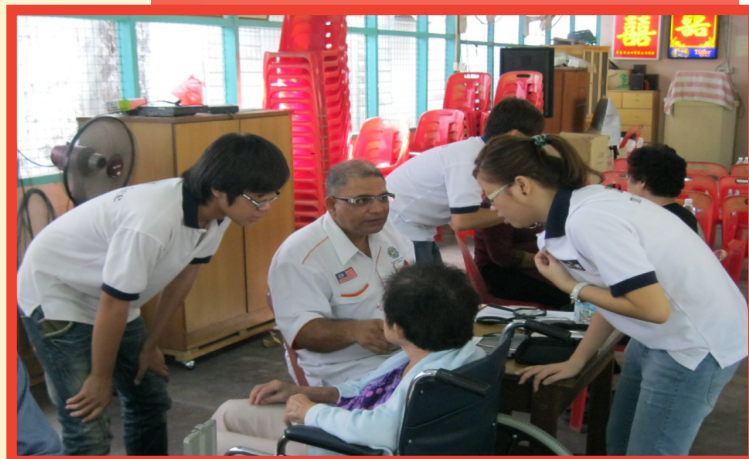
UTARians were interpreting doctor's advice to the patient

The medical team comprised five physicians, one eye specialist, seven paramedics and one dietitian. The community hall of the village was divided into different counters: weight, height, blood pressure, sugar level measure/test and eye test. UTARians helped measure and record the patients' height, weight, blood pressure, sugar level and eye test results. The villagers were very grateful to the visitors for their medical service.