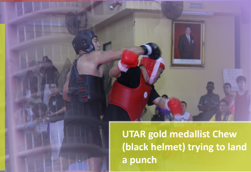
UTAR gold medallist Chew (black helmet) trying to land a punch