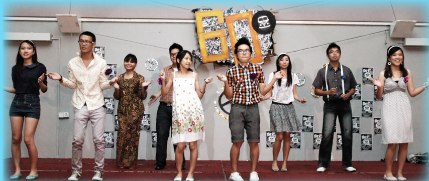
Participants of the catwalk contest performing a dance.