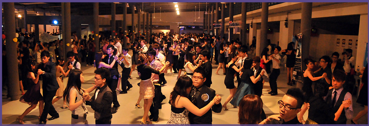
The record - breaking waltz performed by the participants.

On the evening of 10 July 2011, 376 Universiti Tunku Abdul Rahman (UTAR) students literally waltzed into the Malaysia Book of Records at UTAR Perak Campus.