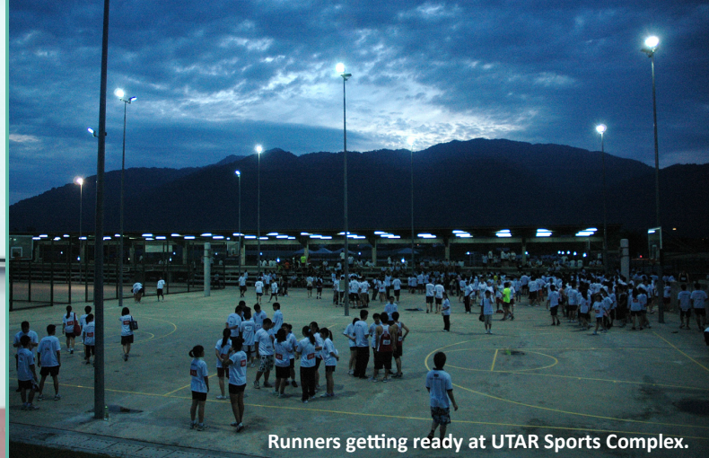
Runners getting ready at UTAR Sports Complex.

The Student Representative Committee is a body that represents UTAR students and acts as a link between the students and the management of the university.