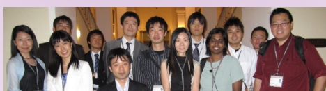
UTAR scientist meets 24 Nobel laureates >p8