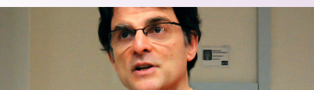
Berkeley professor on computer graphics >p5