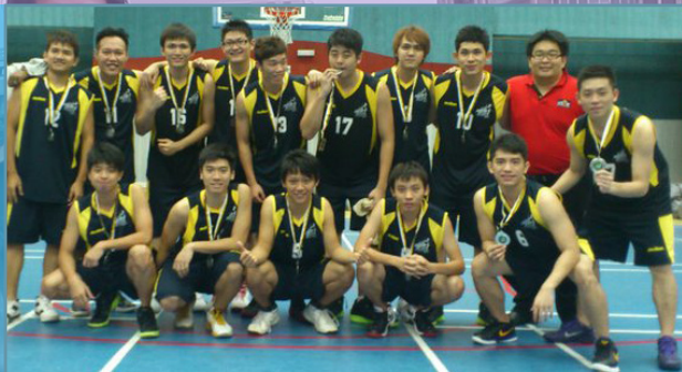
UCBL second runner-up: UTAR Klang Valley team