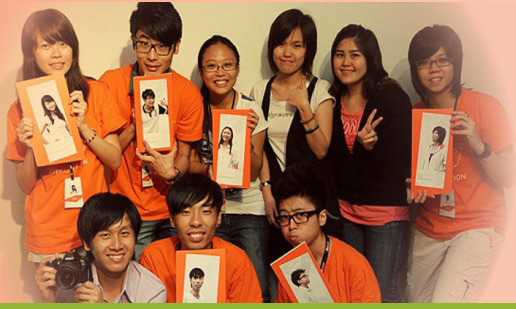
Graphic Design students with their works at the exhibition.