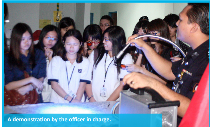
A demonstration by the officer in charge.

The Chemistry Society organised a trip to Makmal Forensik PDRM in Cheras, Kuala Lumpur on 13 July 2011. 43 members participated in the trip, which aimed at educating them about career opportunities in the government sector in the forensic science and technology field.