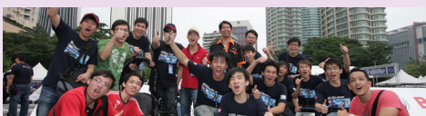
UTAR Raging Bull is Bosch Champ >p10