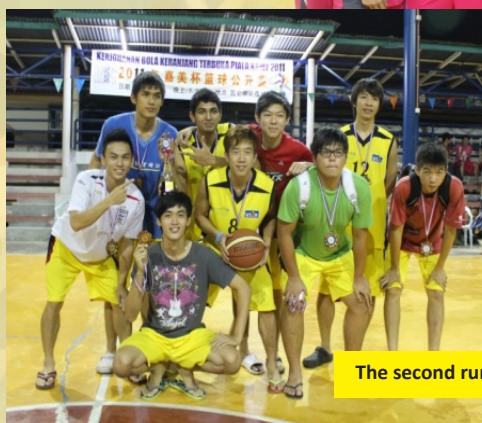
The second runner-up team