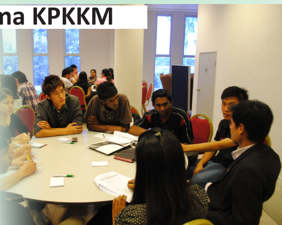
Pegawai KPKKM (kanan) mengetuai perbincangan kumpulan

Bagi melancarkan perjalanan program ini, para pelajar dibahagikan kepada empat kumpulan. Setiap kumpulan diketuai oleh pegawai KPKKM untuk membincangkan isu-isu yang berkaitan dengan pendidikan, konsep 1Malaysia, kepimpinan Perdana Menteri, polis dan keselamatan, pengangkutan awam, politik semasa dan sistem penyampaian kerajaan. Kemudian setiap kumpulan membentangkan hasil perbincangan tersebut.