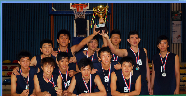
UCBL first runner-up: UTAR Perak team