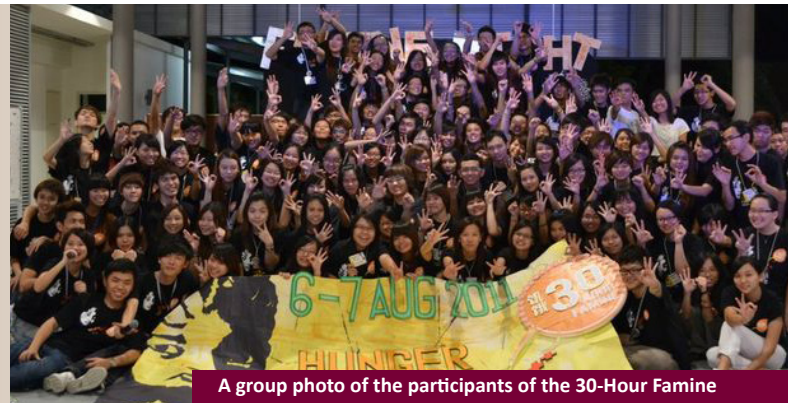
A group photo of the participants of the 30-Hour Famine

Participants of the 30-Hour Famine starved for 30 hours without solid food to experience first-hand the dire conditions that impoverished children and families endure every day. During that time, various educational programmes were conducted, including interactive mini-talks, video presentations, and simulated games to acquaint participants with the worldwide humanitarian work of World Vision.