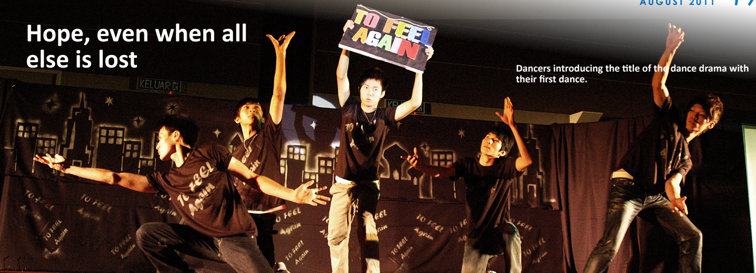
Dancers introducing the title of the dance drama with their first dance.

Organised by the UTAR Dance Club, a dance drama titled "To Feel Again", held at Heritage Hall, UTAR Perak Campus on 27 June 2011, overwhelmed the audience with its story. It initially had a fun vibe, but turned tragic at the end.