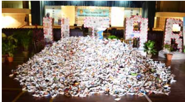
The 51,065-piece masterpiece of the day

After almost nine finger-flicking hours of turning waste magazines into paper boats, everyone's face was lit with pride and the grand hall echoed with cheers when independent witness Suresh Kee See Leng from the Kampar District Council announced that 51,065 paper boats had been folded – a new record in the Malaysian Book of Records for the most number of paper boats folded in a day.