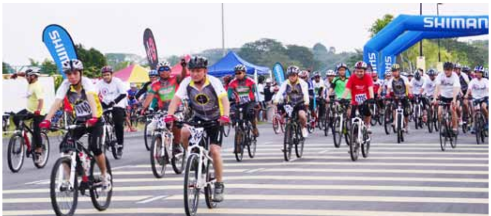
Just after flagged off

“We are glad to participate in the event