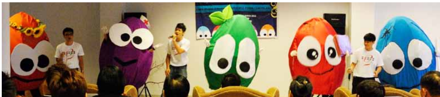
Students performing with the five UTAR PR Campaign mascots