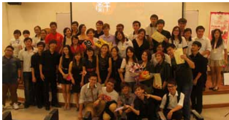
拉曼大学华乐团全体台前幕后工作人员合影