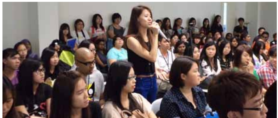
Sesi soal jawab