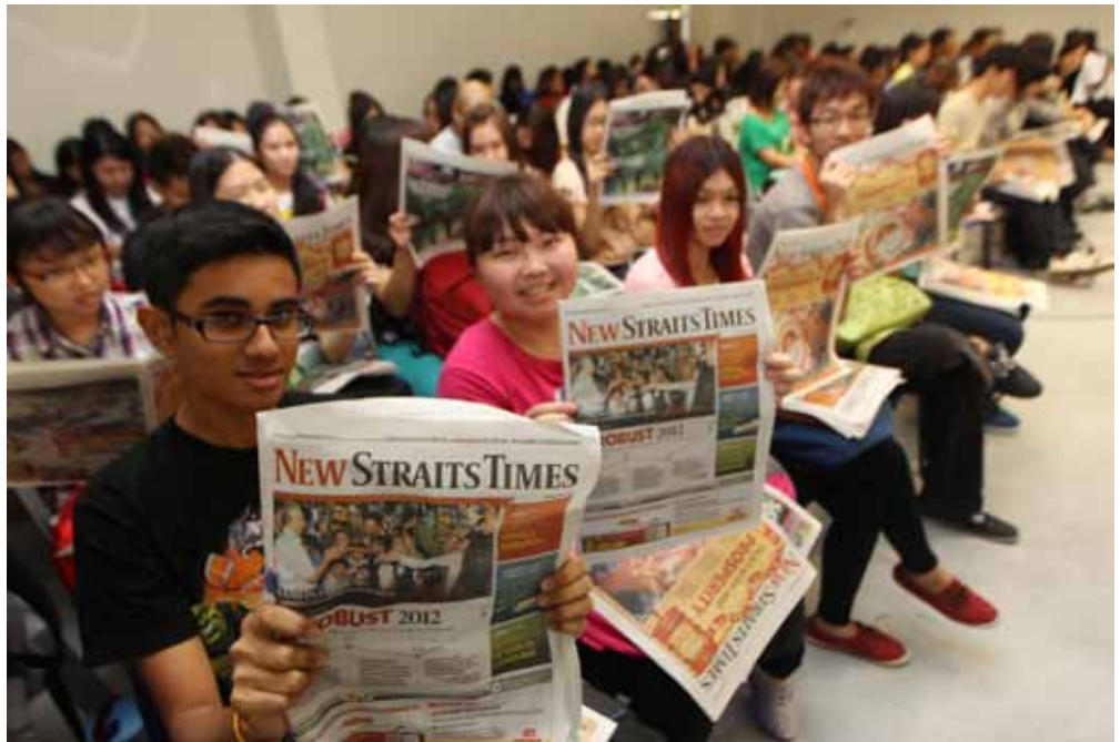
Sebahagian daripada peserta yang mengikuti sesi ceramah NST