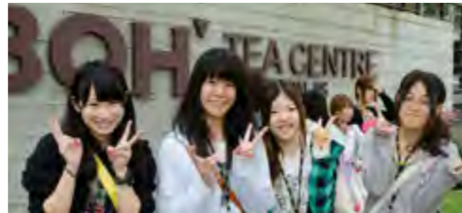
Josai students at Boh Tea Centre

English classes, the group of students led by three lecturers had the whale of a time visiting the tourist sites in Perak. They toured Cameron Highlands, explored the 'Lost World in Tambun', Ipoh and tasted local delicacies such as freshwater prawns in Tanjung Tualang.