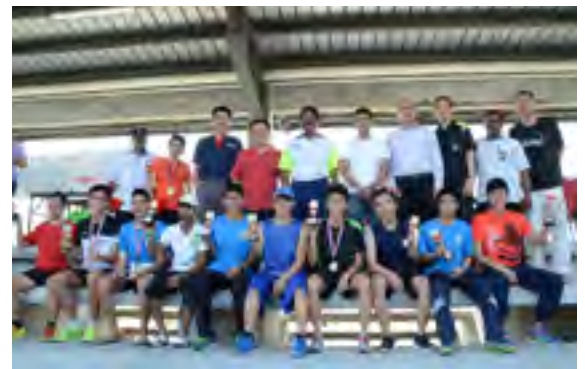
Pemenang kategori Lelaki UTAR bergambar dengan Encik Hew dan penaja