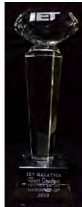
The award: IET Malaysia Best Student Chapter first runner-up

The IET Best Student Chapter awards are given out annually to acknowledge the outstanding leadership and efforts by student chapters. UTAR IET Student Chapter was recognised for the first time as the first runner-up among about 10 IET student chapters in Malaysia.