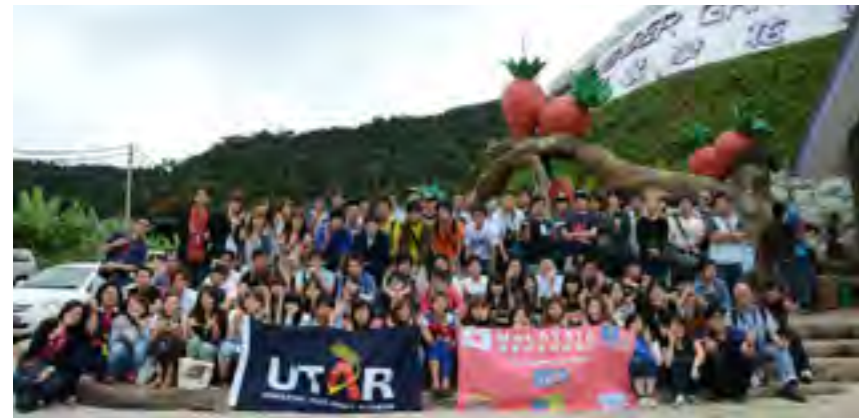
Students from two Josai sister universities at Lavender Garden in Cameron Highlands

Since the group was also on an 'edu-tourism' programme promoted by the Ministry of Tourism, Malaysia, the group had a special meeting with Tourism Board Chairman and former Tourism Minister Dato' Sri Dr Ng Yen Yen at Putrajaya.