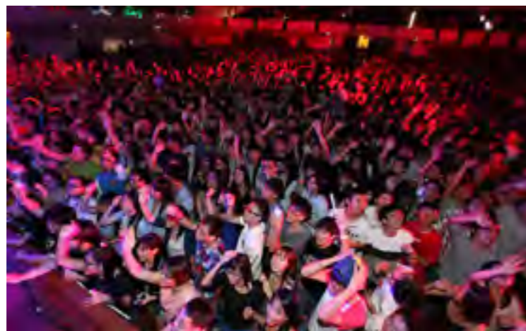
Youth empowerment: The giant crowd of UTAR students

The Cultural Fiesta 2013, themed 'Centuries of Memories', was launched in full force with a staggering 'Rock! The International Concert 2013: Rewind the Time' at Dewan Tun Dr Ling Liong Sik, UTAR Perak Campus on 2 August 2013. The event which was held for the first time by UTAR International Friendship Society aimed to connect local and international UTAR students through the showcasing of different cultural songs, dances, games and cuisines.