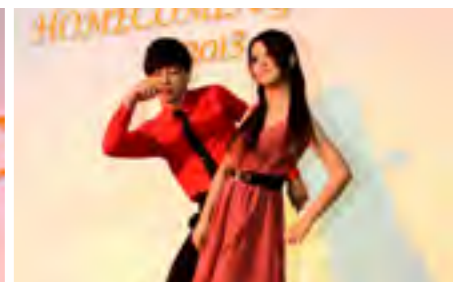
House of harmony: Sketch performers complementing each other in action