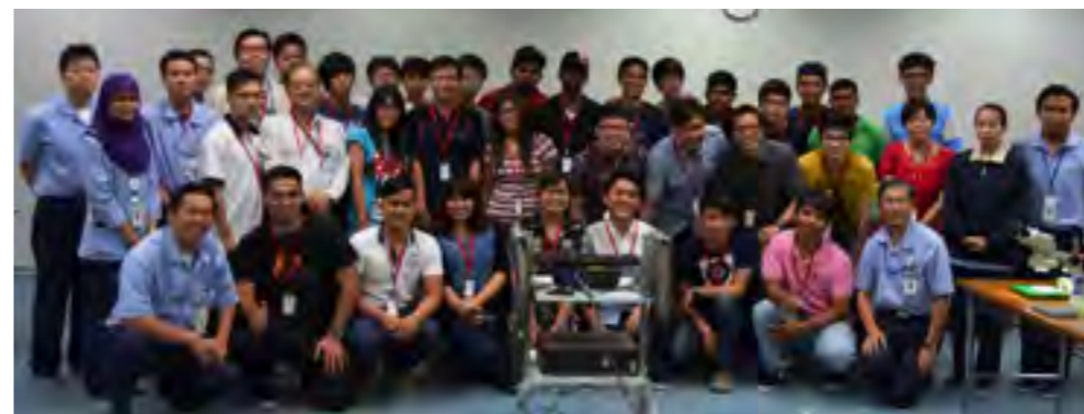
Students and staff from UTAR posing for a group photograph

Twenty-eight students and eight staff from Department of Industrial Engineering UTAR visited Murata Electronics (Malaysia) Sdn Bhd on 28 June 2013. It was a field trip to help the students to deepen their knowledge and interest in automated production environment.