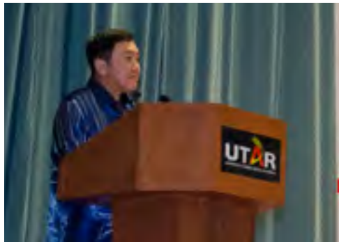
YB Dato' Seri Ong Ka Chuan delivering his opening address

advised the audience to adopt the step-by-step 'AIDA - Attention, Interest, Desire and Action' guide in matters pertaining to mental literacy improvement. He added, "The Festival of the Mind is to create greater awareness among the public about the fullest potential of our minds and to impart the importance of taking care of our minds.