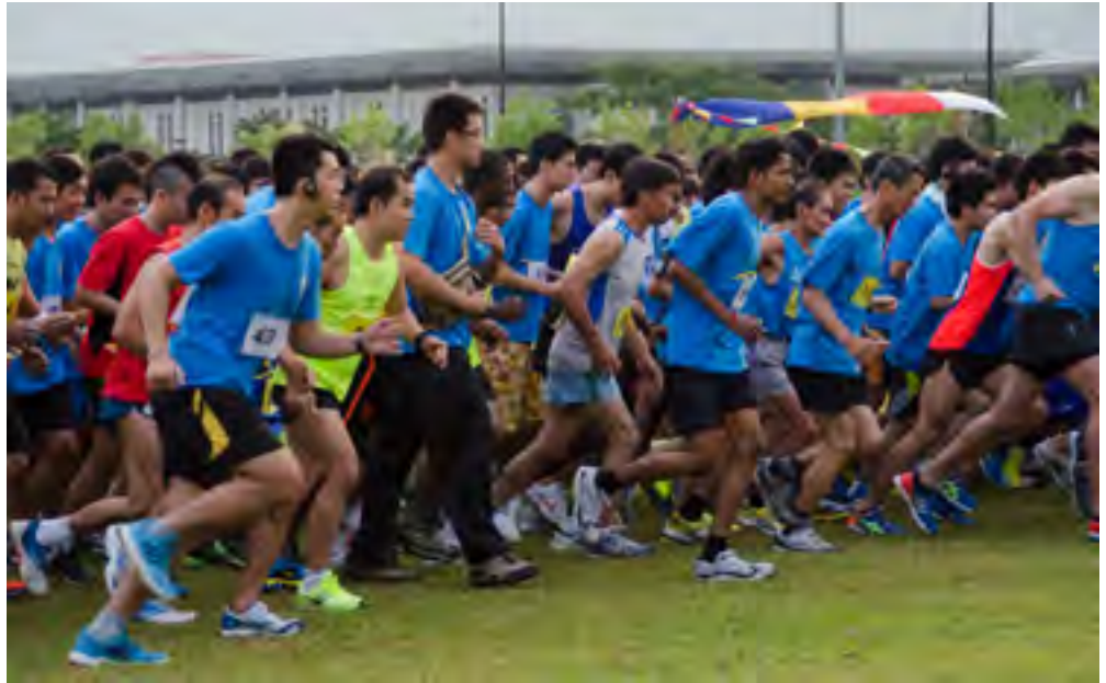
Peserta semasa Acara larian Kampus Perak UTAR Ke-3