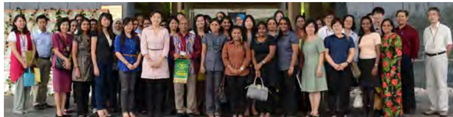
Organisers and participants of UTAR Teacher Development Programme

Thirty-nine English language schoolteachers from four local schools learned more about effective teaching strategies in a Teacher Development Programme held at UTAR Perak Campus on 16 August 2013.