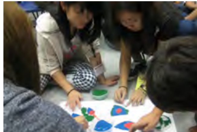
The visitors being thrilled trying their hands on Indian traditional art 'kolan'