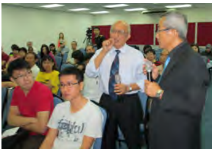
A member in the audience asking a question