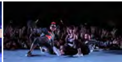
Class act: Da. Mon. Ster posing for a group photo amid whooping fans