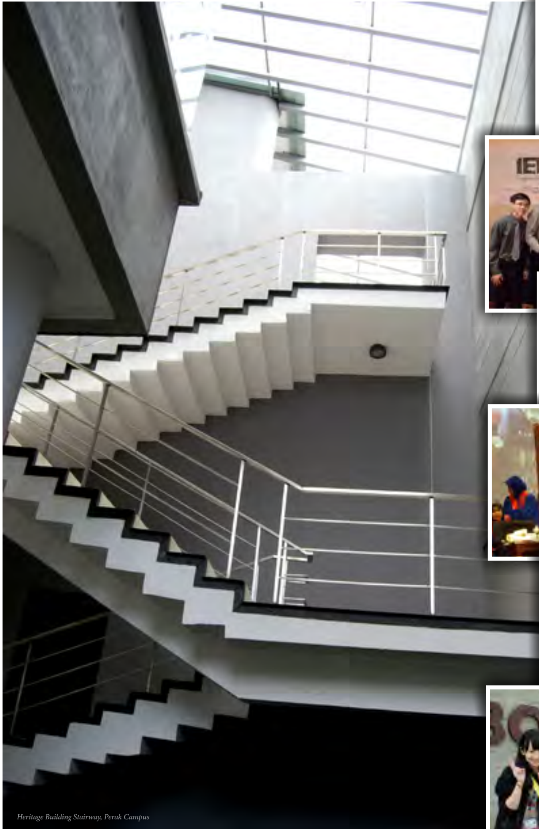
Heritage Building Stairway, Perak Campus