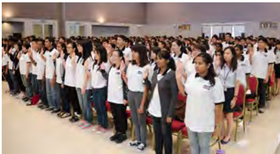
New students of October 2013 Intake taking their oath as students of UTAR

As part of the October 2013 Intake Orientation, a mass call was held at the Heritage Hall at UTAR Perak Campus on 9 October 2013. A total of 695 students who registered for the Bachelor's degree were present at the event.