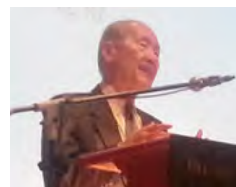
Prof Wang Gungwu addressing the audience