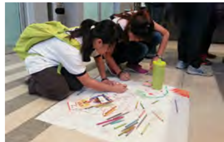
Students hard at work on an activity

"This counselling and wellness week is beneficial to everyone,"