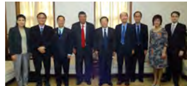
UTAR delegates and National Taiwan University representatives