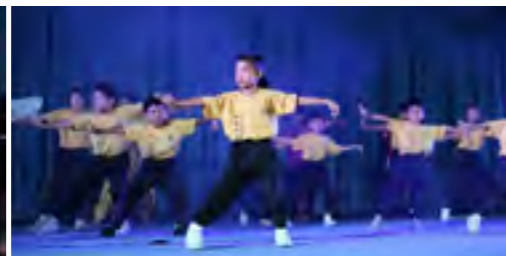
Wonder Kids: Young wushu exponents demonstrating the self-defense art