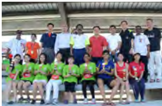
Pemenang kategori Wanita UTAR bergambar dengan Encik Hew dan penaja