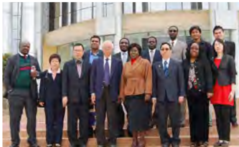
UTAR delegates and USIU representatives at the USIU library