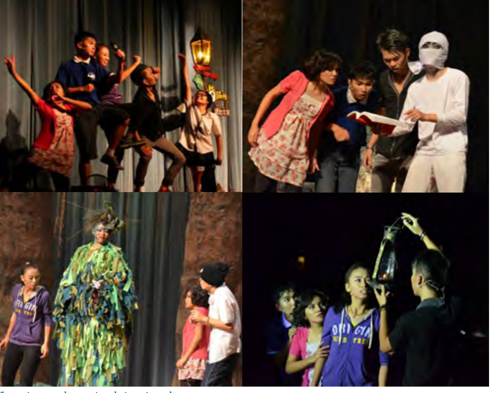
The main casts showcasing their acting talents

Choong was so impressed by the theatrics and he announced that Dato' Mah, on behalf of the Perak Health, Public Transport, Non-Islamic Affairs, National Integration and New Villages Committee will donate RM3,000 to support the organising committee's initiative.