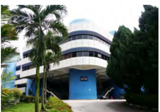
PI Campus PD Block