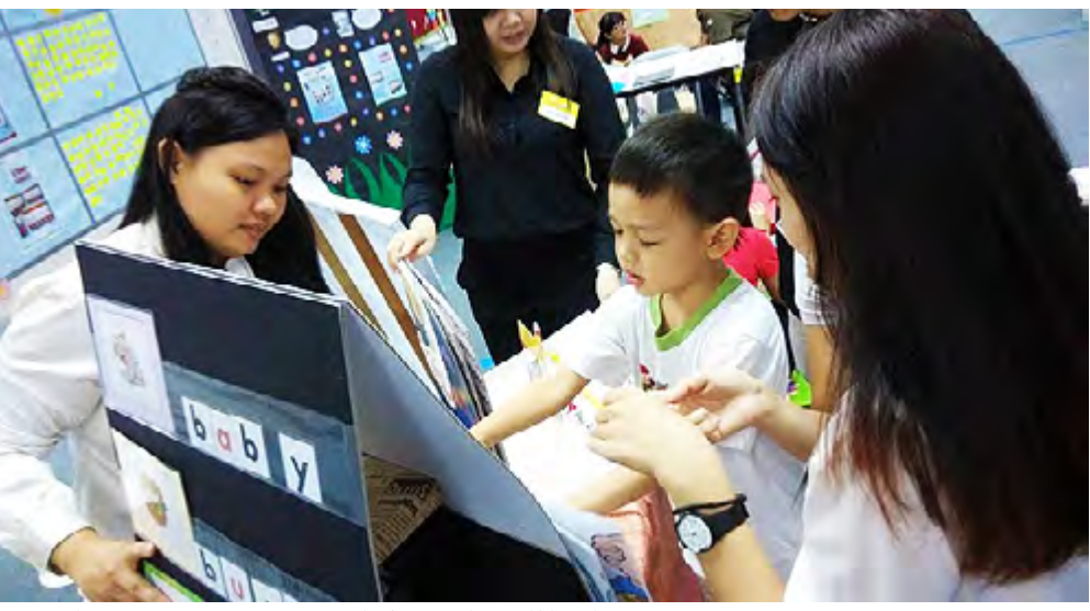
ECS students assisting a participant at the 'mix-and-match' booth

in designing practical and marketable teaching materials. Much attention and time have been spent on the making and setting up of the teaching aids on display today. The various displays are not only for children with normal learning abilities, but also for children with special needs."