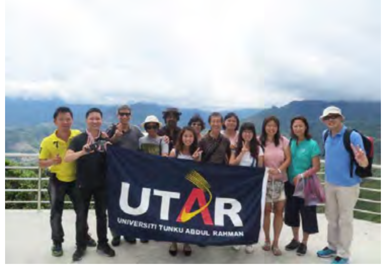
UTAR alumni posing for a group photo in Kundasang, overlooking the majestic Mount Kinabalu

networking opportunities. For the trip, DARP gathered alumni who love to travel, some from as far as Penang, Sandakan and Tawau, to visit alumni living in Kota Kinabalu.