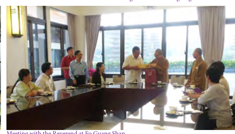
eeting with the Reverend at Fo Guang Shan