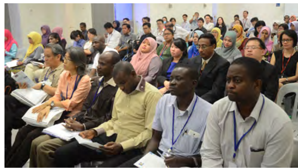
Participants at the BAFE 2015

a very constructive platform for more interdisciplinary studies."