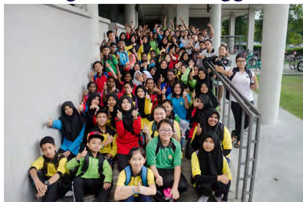
Para peserta bengkel bergambar dengan pelajar-pelajar UTAR