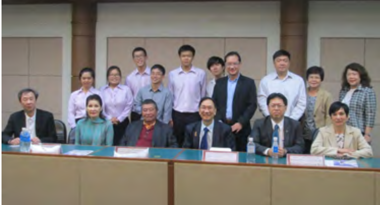
Delegates with some Malaysian students attending Hai Oing Ban (海青班) at FCU

Tanzanians studying full-time in UTAR. The subsequent USTAR study tour to Sydney and Adelaide for collaborations resulted in student exchange training programmes between TAR UC Johor branch and TAFE College.