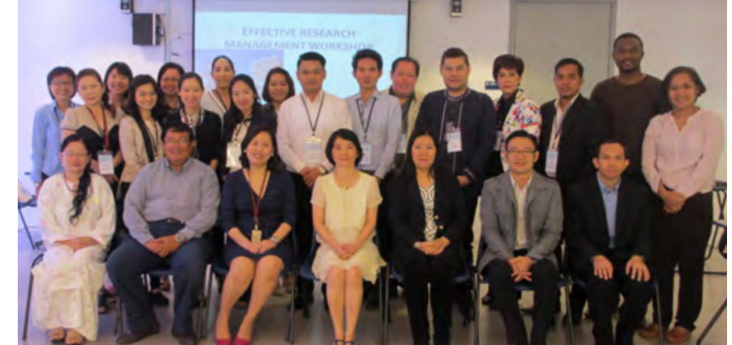
The participants and facilitators

their last day in Malaysia. They were briefed about the development of Putrajaya and explored various sites in the federal territory. This event was organised by UTAR's