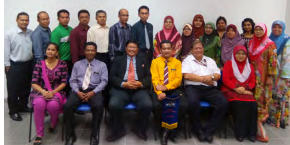
Participants with the organising committee

Attended by a total of 22 participants comprising school teachers from SMK Methodist (ACS) Kampar, the workshop covered relevant topics including the importance of using online educational resources in teaching, online teaching tools,