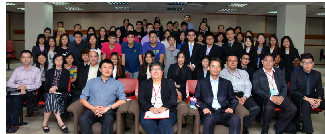
Participants of 5MP

Wang mentioned, "Such events are important as they cultivate two important skills that