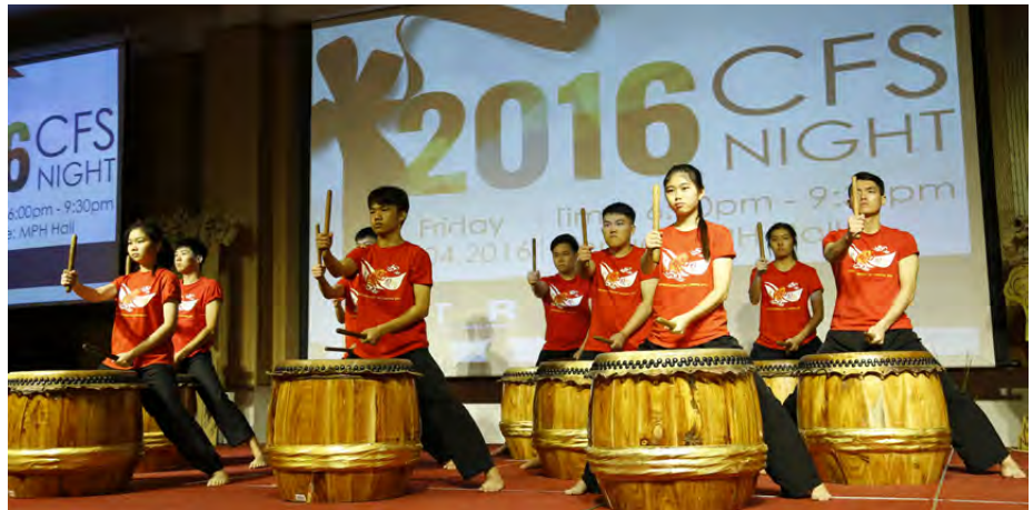
Persembahan gendang 24

Beliau menambah, "Saya ingin mengatakan bahawa kira-kira 80 peratus daripada mahasiswa/pelajar kita datang dari CFS. Oleh itu, saya ingin mengucapkan terima kasih kepada semua kakitangan CFS atas usaha keras dan tahap dedikasi yang tinggi anda dalam melahirkan pelajar yang berkualiti. Semangat kerja berpasukan