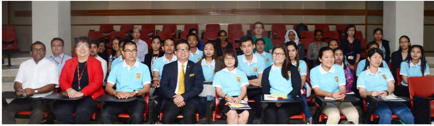
UTAR delegates together with the visitors from Norton University

UTAR Sungai Long Campus received visitors from the Graduate School of Norton University from Cambodia on 8 April 2016. There were 15 MBA students along with two lecturers and one official. Their visit aimed to build rapport between UTAR and Norton's Graduate School in order to promote mutual understanding and explore common grounds for future collaborations.