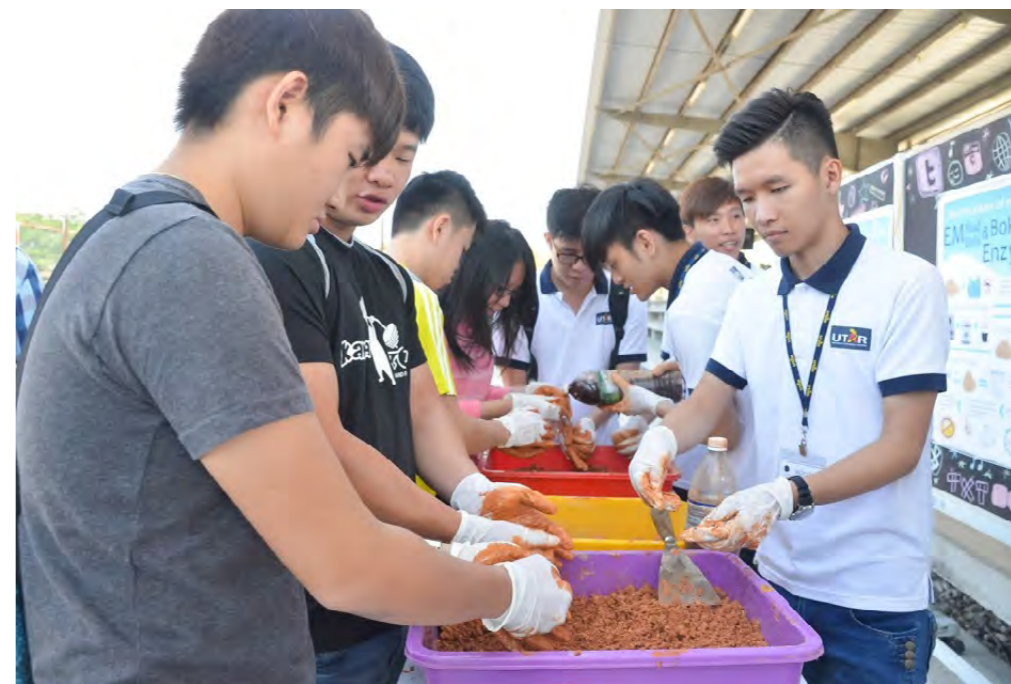
UTAR students guiding the participants in making their own mud balls