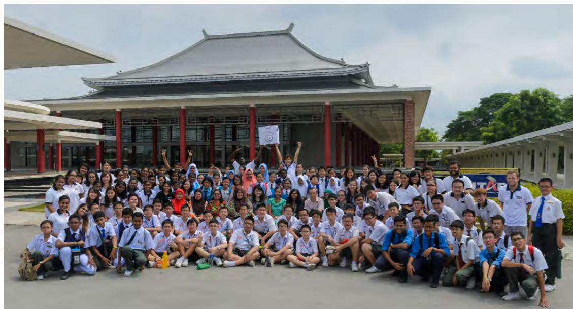
A group photo of participants, schools teachers, UTAR staff and students

More than 80 secondary school students from three schools, namely SMJK Sam Tet Ipoh, SMK Methodist (ACS) Kampar, and SMK Malim Nawar, had an elevating learning experience during the "Reading Campaign" at Kampar Campus on 15 April 2016.