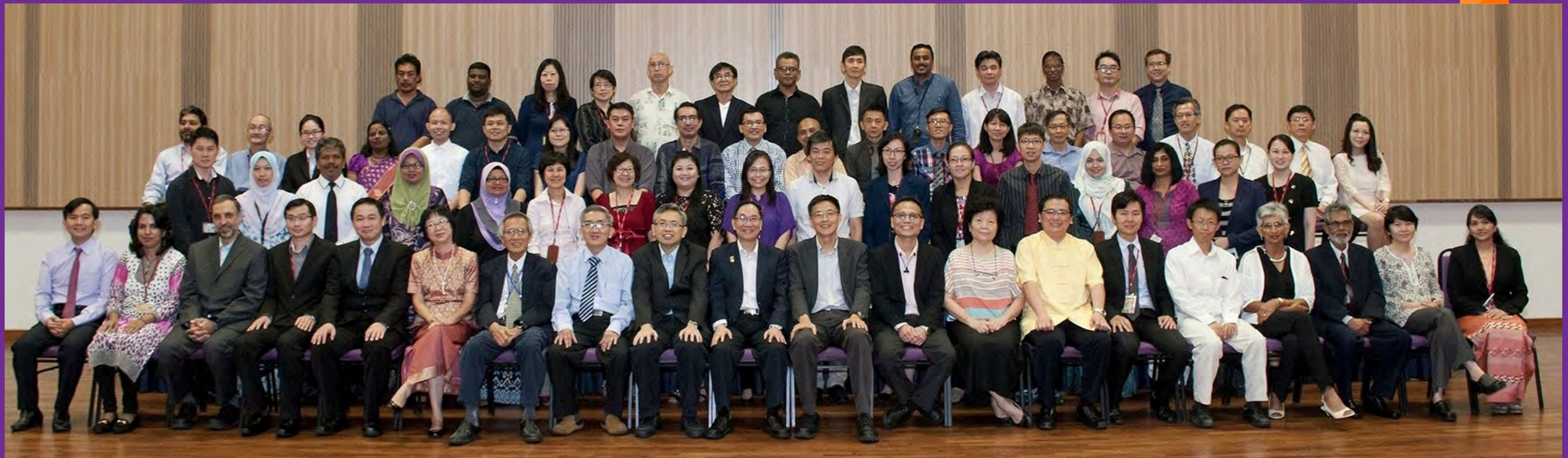
The Long Service and Excellence Awards recipients

UTAR Staff Long Service and Excellence Awards was held on 17 May 2016 at UTAR Multi-purpose Hall. The purpose of this event was to honour the contributions and unconditional dedication of staff who have served UTAR for more than ten years.