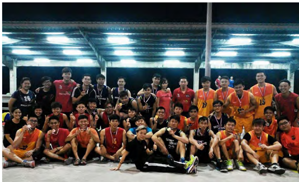
The selected teams and organising committee

This year, the basketball championship which was open to all UTAR students saw a total of 15 participating teams, with each team comprising 12 players.