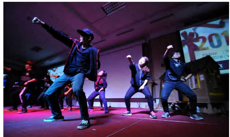
Persembahan tarian hip-hop