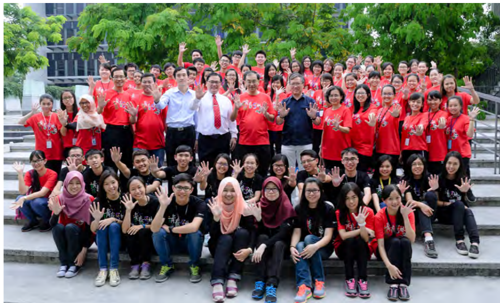
The guests and participants