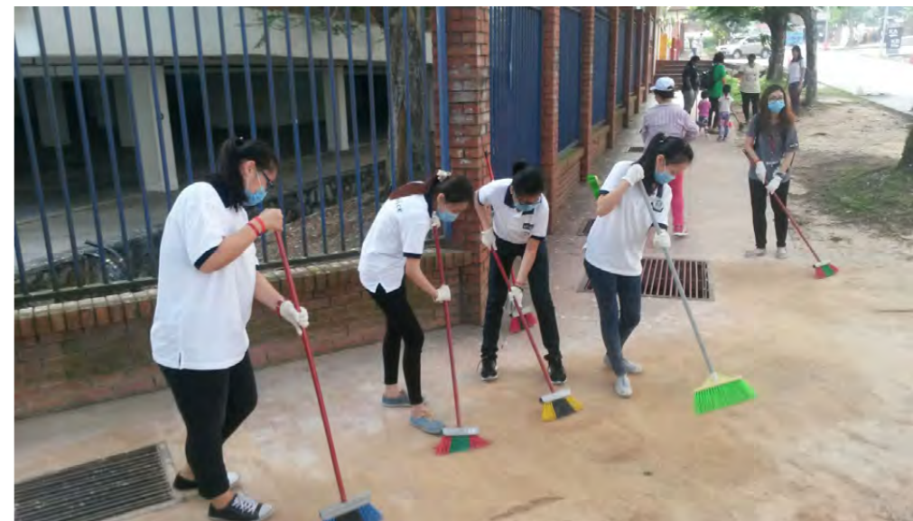
Students clearing the pedestrian walkway

The Kajang Municipal Council (MPKJ) gave a talk on maintaining a healthy