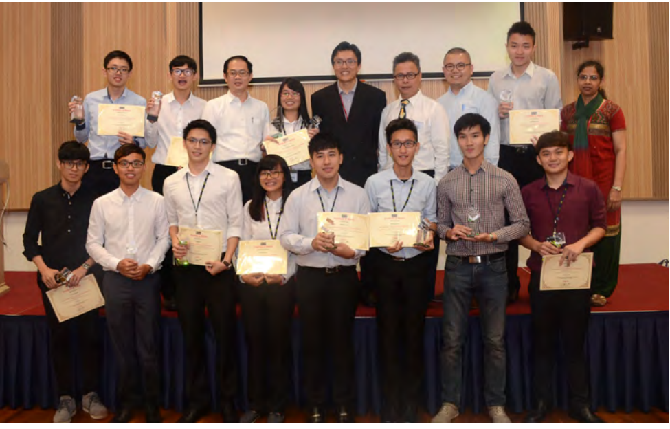
Winners of the FYP Competition

home with cash prizes of RM250, while the first runners-up and second runners-up won RM150 and RM100 respectively. All also received trophies and certificates.