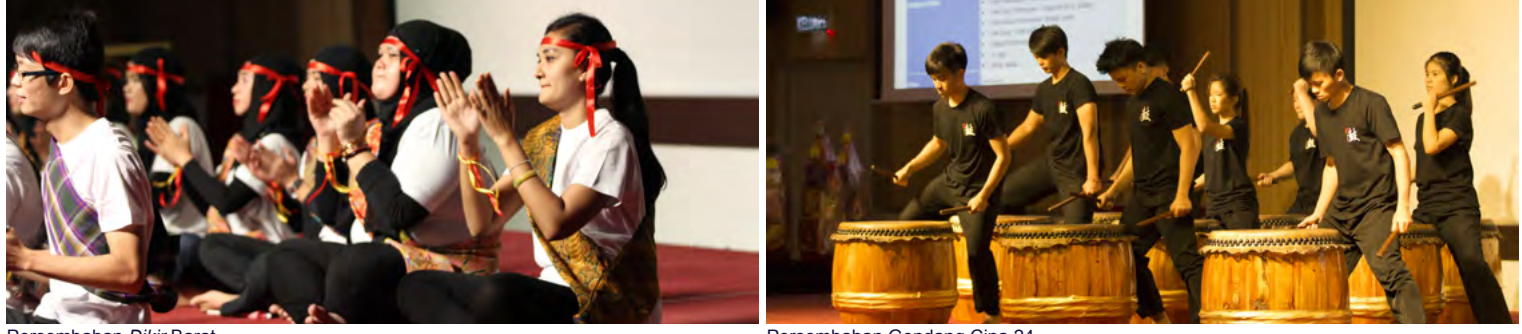
ersembahan Dikir Barat

Malam Kebudayaan ini merangkumi aktiviti-aktiviti yang mempamerkan kepelbagaian budaya Malaysia. Ia terdiri daripada pelbagai persembahan kebudayaan vang disampaikan khas oleh pelajar-pelajar, tenaga pengajar dan ahli-ahli kakitangan pengurusan UTAR dari kedua-dua kampus iatu Kampus Kampar dan Sungai Long. Antara persembahan yang disampaikan pada malam tersebut ialah persembahan Gendang Cina 24. persembahan vokal dan koir, deklamasi sajak, tarian tradisi India dan persembahan Dikir Barat. Malam Kebudayaan tersebut diakhiri dengan nyanyian dua buah lagu patriotik yang bertajuk "31 Ogos" dan "Sehati Sejiwa".