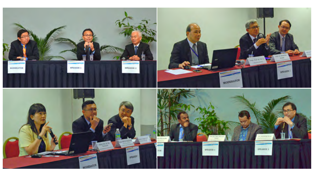
Speakers and moderators at the parallel sessions

ASEAN working together with Taiwan on R&D and human capital development.'