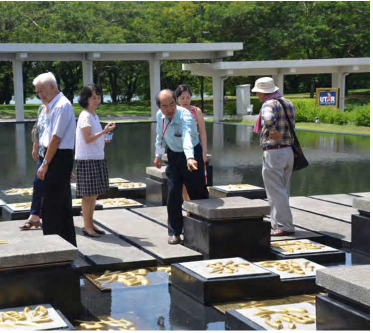
The delegates and UTAR management staff during the campus tour

internship placement opportunities for UTAR students at PCCCI member companies, invitation for recruitment drives where PCCCI member companies can interview and recruit UTAR graduates, and promotion activities aimed to introduce UTAR programmes to PCCCI member companies' staff whom wish to further their studies. It is through the university's commitment