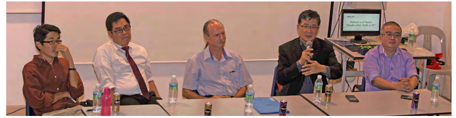
Panel of guests sharing their opinions

Events such as the IAP forum are one of the many strategies FICT employs in enhancing its current programmes.