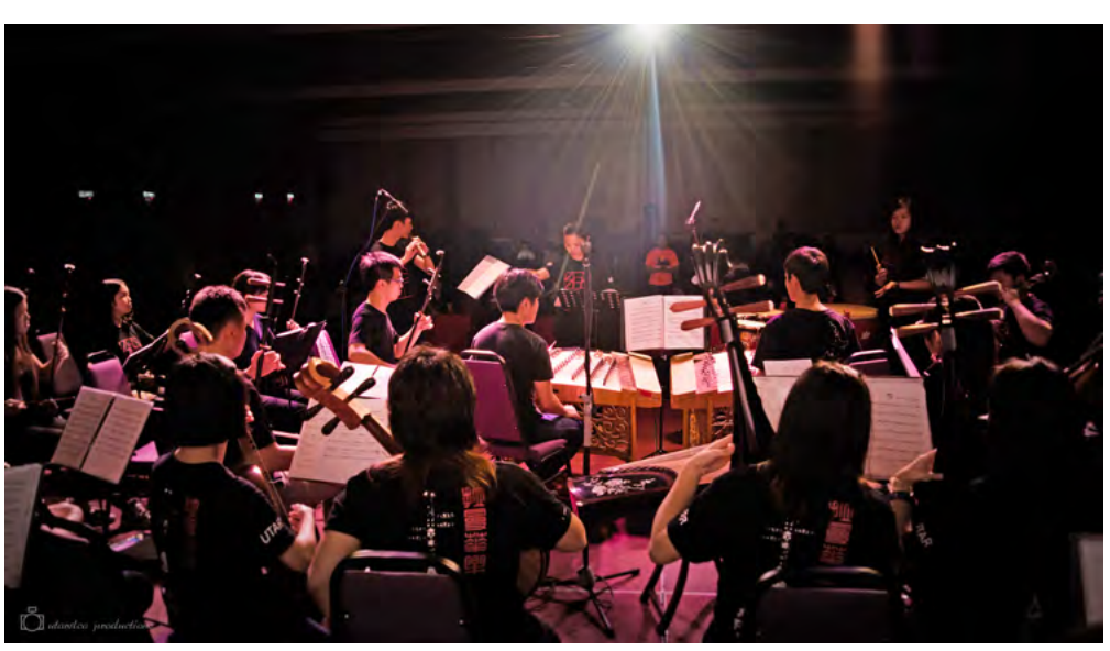
The orchestra prepping before the concert

A total of 13 songs were played during the concert. Among the songs that were played were the 'Fishermen's Triumphant Song', 'Laputa: Castle in the sky - Carrying You', 'Viva la Vida', 'Sakura-sakura', 'Princess Mononoke' and 'Harvest Festival'. The group even played a refreshing mashup that combined Kitaro's 'Matsuri' and the theme song from the blockbuster movie Ip Man.