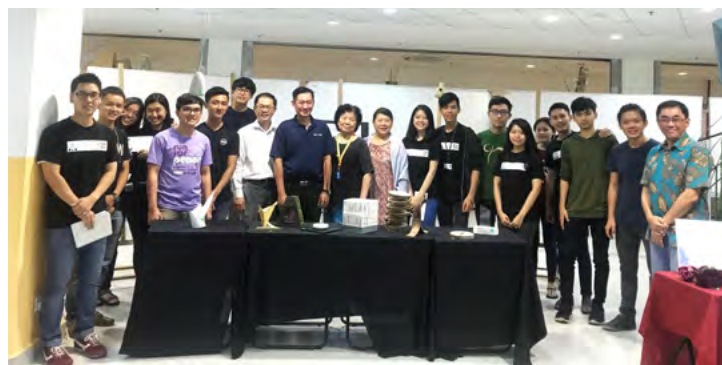
Organising committee, staff and students

The Architecture Society organised a Souvenir Design Competition on 27 October 2017 at Sungai Long Campus.