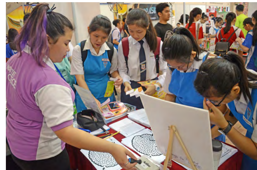
Visitors at the games booth

activity corner—green glade, cool interactive sessions as well as a showcase of training programmes, consultative services, videos and mental-literacy-related products. Apart from that, there was a lucky draw session which offered visitors a chance to win attractive prizes.