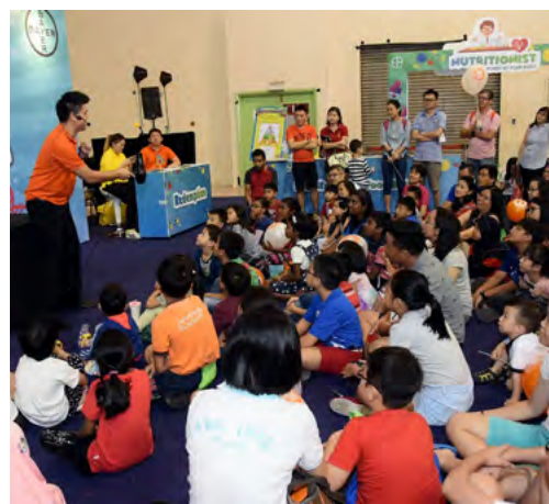
Bayer's multi-activity booth