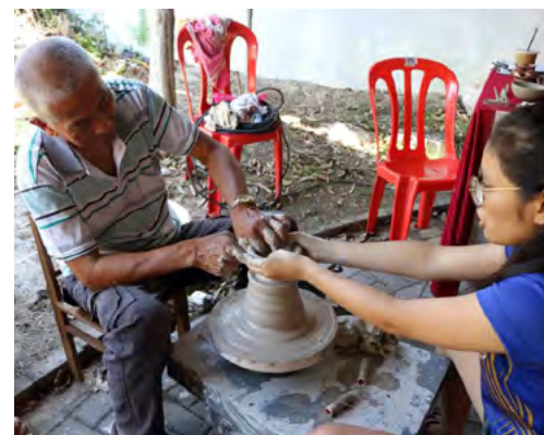
A visitor trying her hand on pottery making

UTAR Faculty of Business and Finance (FBF) hosted the official launch of the Asia-Pacific Applied Economics Association (APAEA) on 8 November 2017 at Kampar Campus.