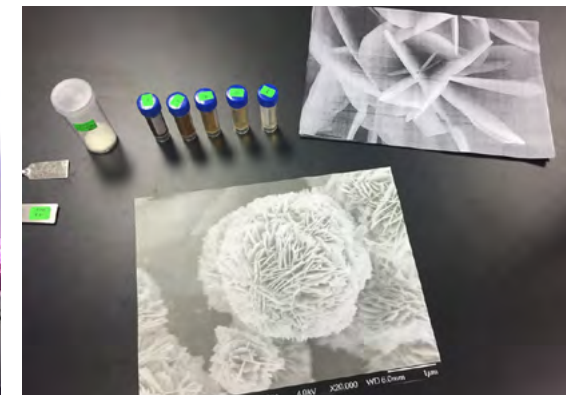
(Inset photos) Three-dimensional hierarchical structure photocatalysts with flower-like and spherical-like morphologies. The different tubes also show the colour changes of palm oil mill effluent for different exposure times under photocatalytic reaction.