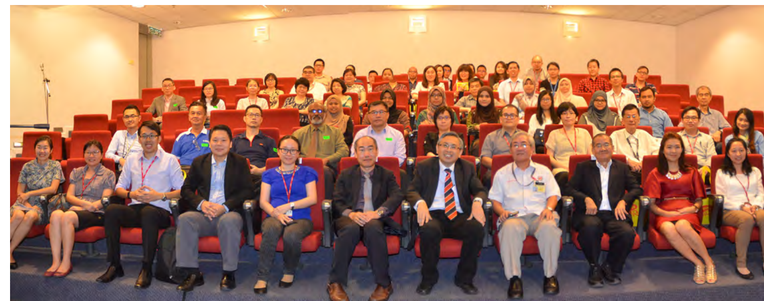
Committee members of the project with the participants

presented to Rumah Solehah. Moreover, a soap-making workshop was organised to teach and encourage the residents of Rumah Solehah to produce their own handmade soap and sell it for an extra income.