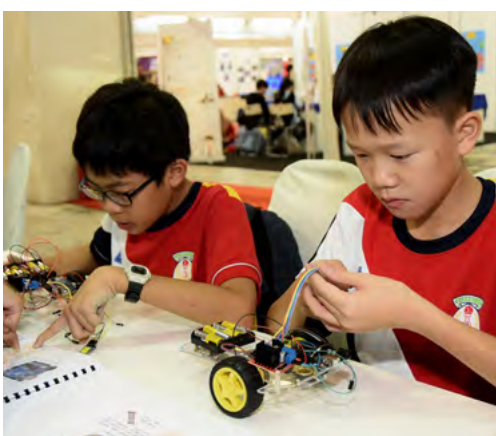
Robot-making workshop by UTAR Lee Kong Chian Faculty of Engineering and Science