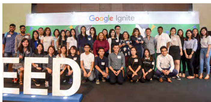
UTAR students and academic staff at the award ceremony

UTAR emerged as a big winner in the Google Ignite Career Fair 2017, winning both the Excellence Award and the Star Award in the Universities category, held on 28 October 2017 at the Double Tree Hilton Hotel, Kuala Lumpur.