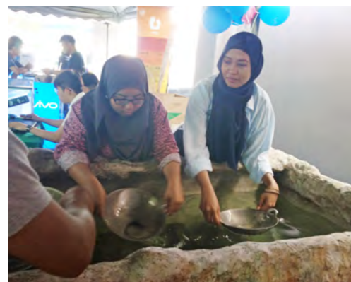
Visitors experiencing the dulang washing process