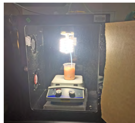
Photocatalytic system under fluorescent light irradiation