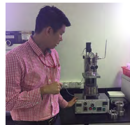
Dr Sin explaining the function of Teflon-lined stainless steel autoclave