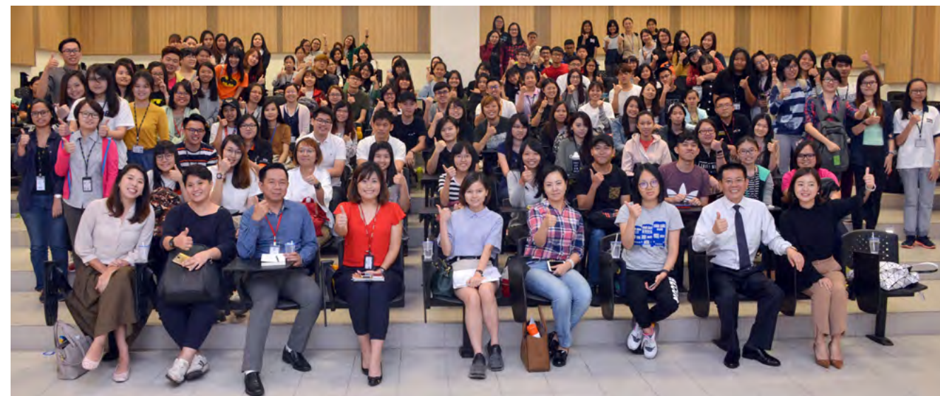
HME visitors with UTAR lecturers and students

of understanding with UTAR on 27 October 2017 for strategic collaboration in the areas of culture, media and broadcasting as well as education to fully utilise the resources of the two parties for the implementation of the Belt and Road initiatives.