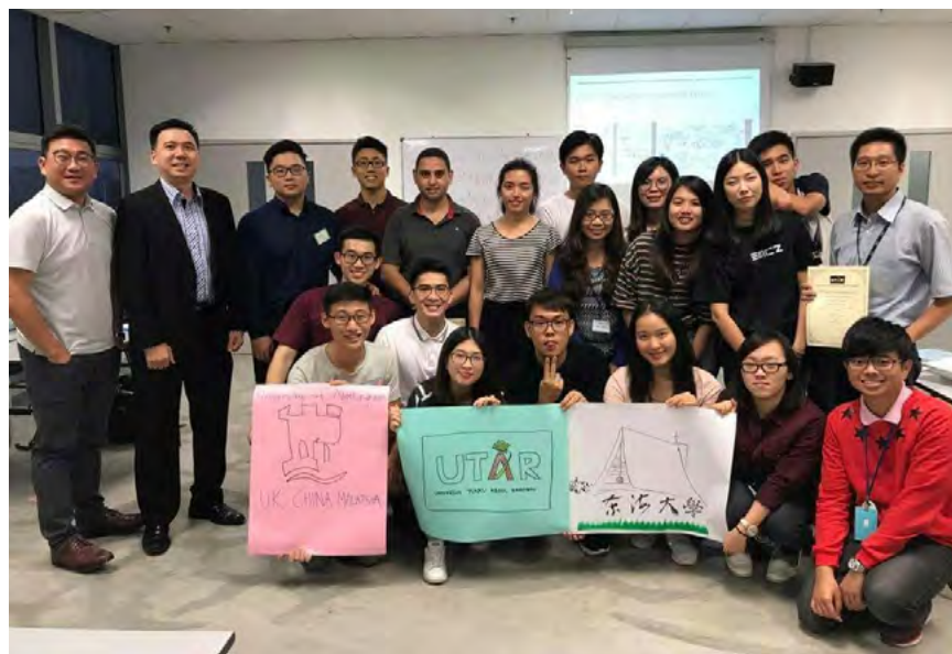
Tunghai University staff and students attending the Design Thinking workshop with UTAR staff and students

Tunghai University, the first private university in Taiwan, has been a leading university for its excellence and innovation since its founding in 1995. Tunghai University is continuing the founding spirit of Christian