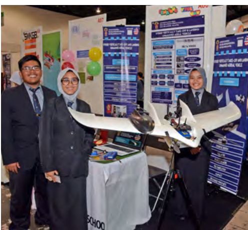
Students from Sekolah Menengah Sains Hulu Selangor displaying their project