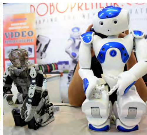
Academy of Science Malaysia booth displaying programmed robots