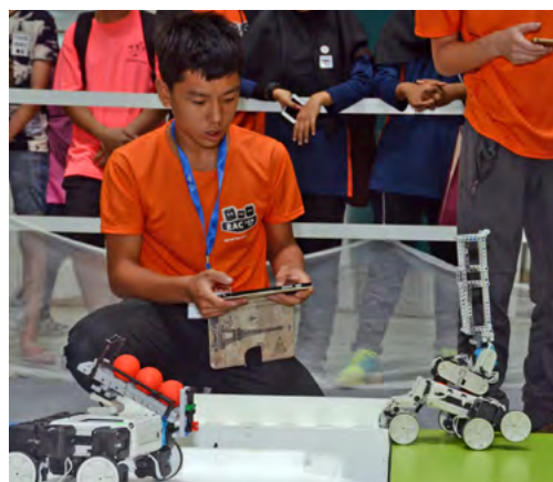
MyMaker Soccerbotz Competition