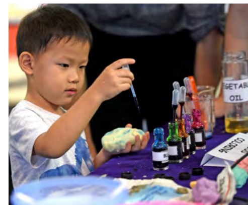
School students and children enjoying the activities at the workshops