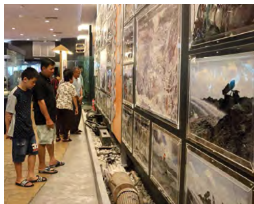
Visitors learning the history of Kinta Valley's tin mining industry as they tour the museum