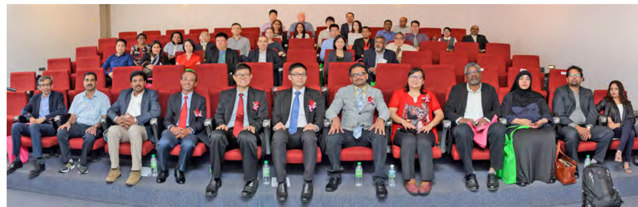
A group photograph to mark the opening ceremony

The conference saw the participation of about 30 academics from the United Kingdom, Australia, New Zealand, India, China, Pakistan and Malaysia.