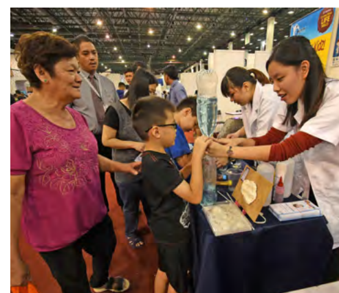
Hands-on activities for visitors from all walks of life