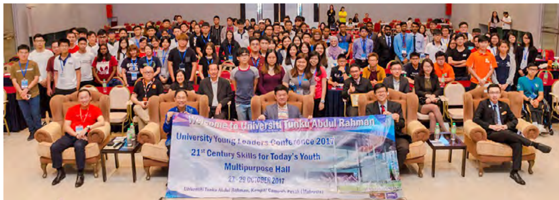
UYLC 2017 VIPs, sponsors and participants after the opening ceremony