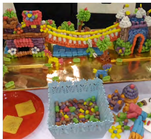
Creative nuudles artwork made from corn starch and food colouring at the STEM Movement booth