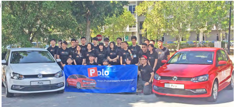
Para peserta di tapak praktikal pemanduan

kelajuan yang lebih tinggi, yang boleh dijuruskan kepada kecederaan yang teruk. Tambahan pula, beliau berkata bahawa pemandu yang memandu kereta dalam kelajuan 80km/j mempunyai 20 kali ganda kemungkinan yang lebih tinggi terlibat dalam kemalangan maut.