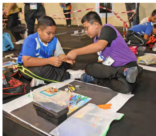
Students constructing small-sized car using recyclable materials