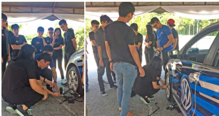
Para peserta mempelajari teknik-teknik menukar tayar