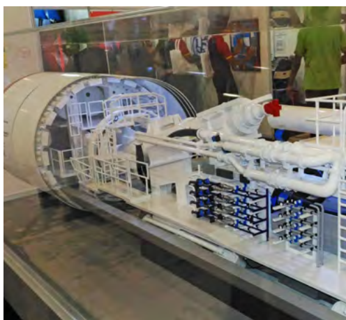
Tunnel Boring Machine at the MMC Gamuda booth