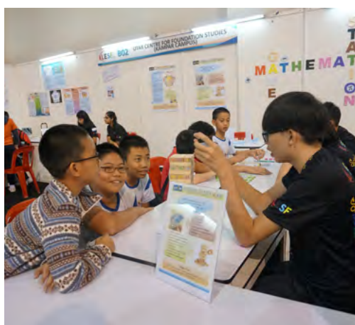
Mathematics game station by UTAR Centre for Foundation Studies