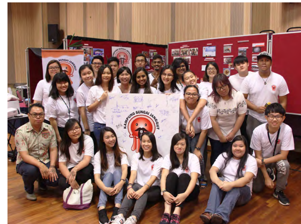
UTAR Media and Creative Studies Final Year students with their supervisors and student helpers

As part of the village's beautification project, students painted murals to beautify the village. Education on recycling and waste collection was also done to keep the village clean. Map boards have also been placed