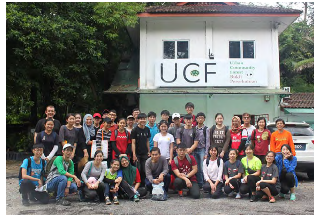
The volunteers and MNS members