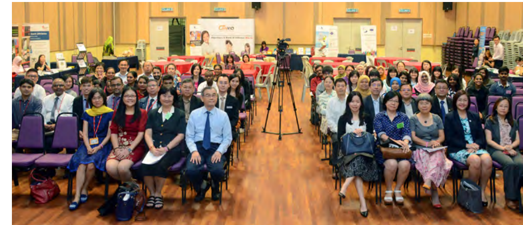
The invited speakers and participants at the conference

Keng said, "It is extremely important for educators like us to seek for a more holistic approach which emphasises the humanity, research and medical aspects in order to help develop a more cohesive system for the cancer patients."