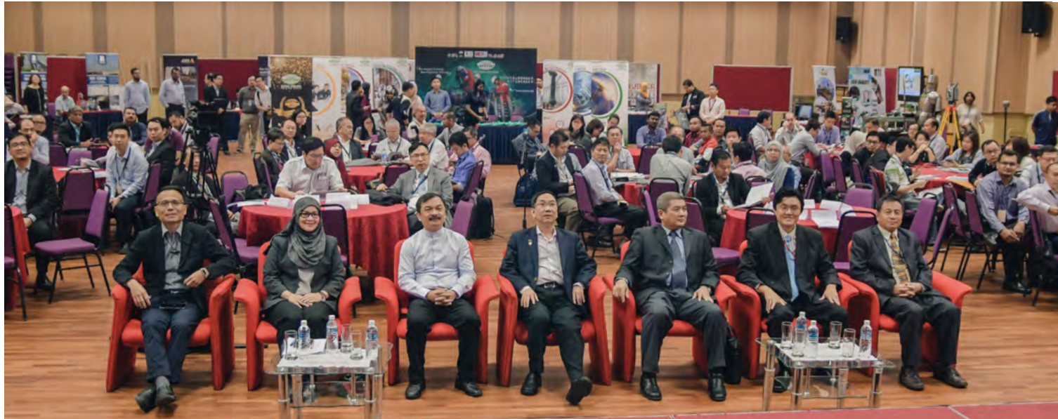
The inaugural symposium saw more than 170 participants

UTAR Centre for Railway Infrastructure and Engineering (CRIE) organised the inaugural Symposium on Railway Infrastructure and Engineering on 24 January 2018 at the Sungai Long Campus.