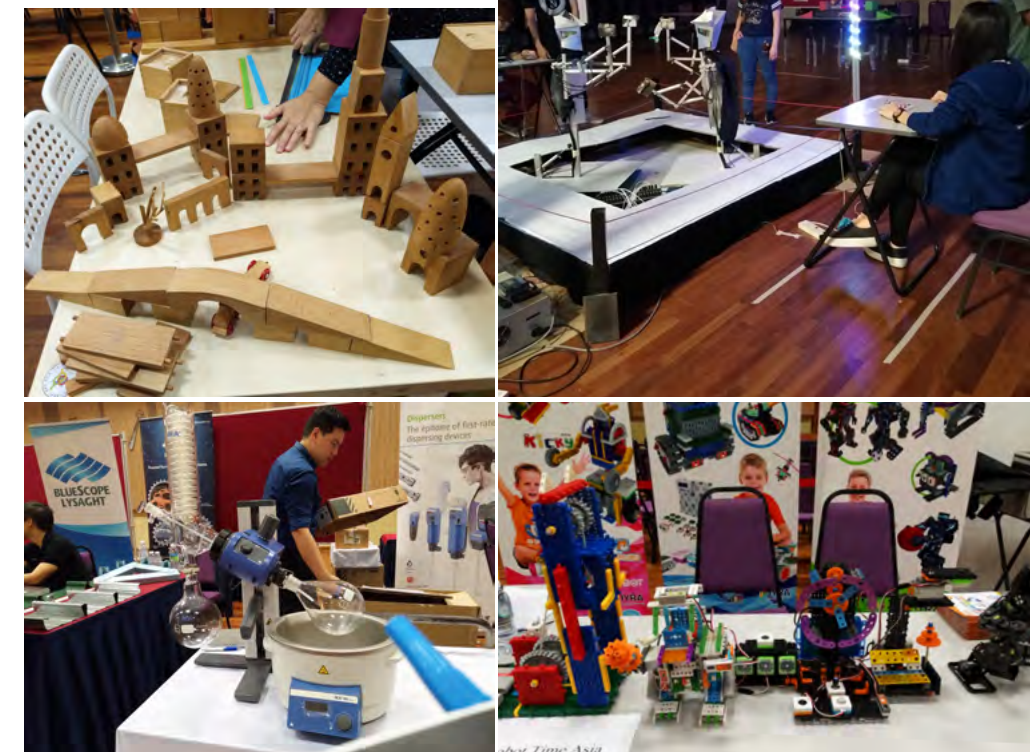
Clockwise from top left: The carnival and exhibition display

of Mechanical Engineers, Institution of Civil Engineers, Institute of Electrical and Electronics Engineers, Institute of Materials, Malaysia, American Society of Heating, Refrigerating, and Air-Conditioning Engineers Student Chapters, as well as UTAR Robotics Society, Mathematics Society, Architecture Society and Actuarial Science Society.