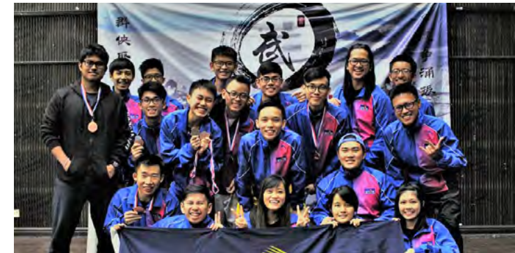
UTAR Wushu team at the championship

A team of 19 athletes from the UTAR Wushu team won one gold, four silver and nine bronze medals at the Wushu Intervarsity Championship. It was held from 25 to 26 November 2017 at Universiti Sains Malaysia, Health Campus in Kubang Kerian, Kota Bharu, Kelantan.