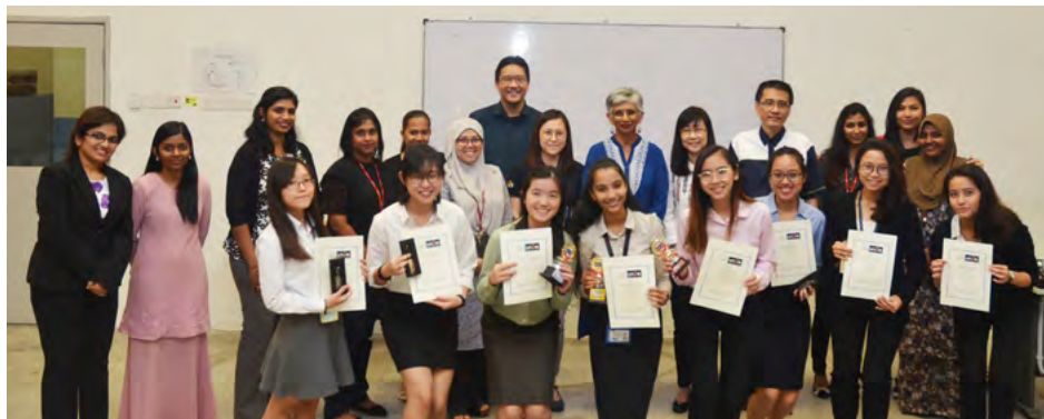
The judges with the participants and winners

The Centre for Foundation Studies (CFS) organised a public speaking competition on 24 November 2017 at Sungai Long Campus.