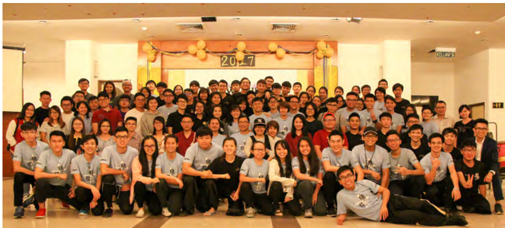
Jawatankuasa penganjur pameran