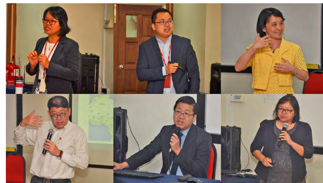
Speakers delivering their presentation

cooperation and building new emerging economies. The objective of the seminar was to evaluate whether BRI initiatives affect Malaysia as a country and also other consequences and implications affecting Malaysian at large. The topics presented ranged from a historical perspective of Malaysia and China diplomatic relations to a geopolitical understanding behind