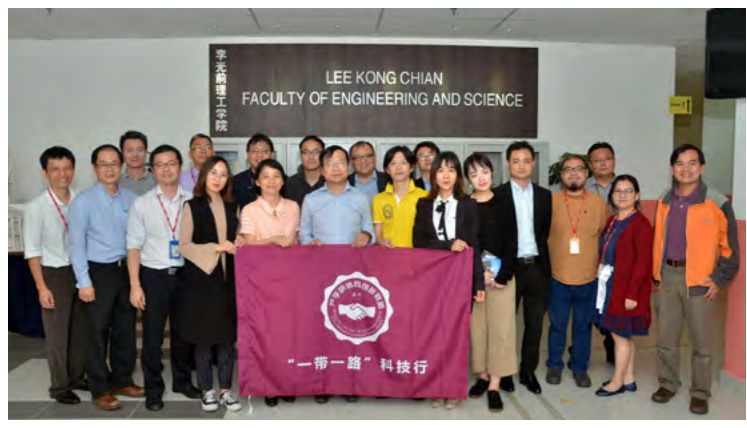
Representatives from the "Belt & Road" Science and Technology Industries visiting UTAR