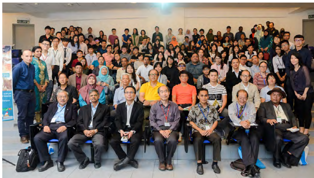
The organising committee, speakers and participants