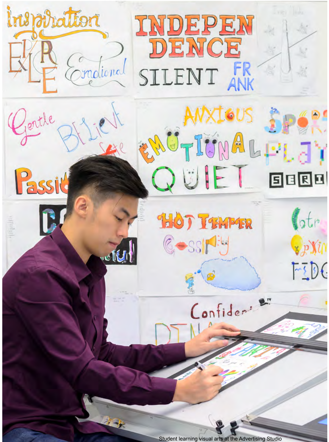
Student learning visual arts at the Advertising Studio