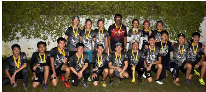
The winning team 4.3°N

Team 4.3°N from UTAR Kampar Campus swept gold following an outstanding 16-4 win against the group Lycans from Universiti Teknologi MARA Shah Alam. The Nottingham Ultimate Battle Royale (NUBR) 2017 was held at the University of Nottingham Malaysia Campus on 2 December 2017. It was organised by The Ultimate Frisbee Club of University of Nottingham Malaysia Campus.