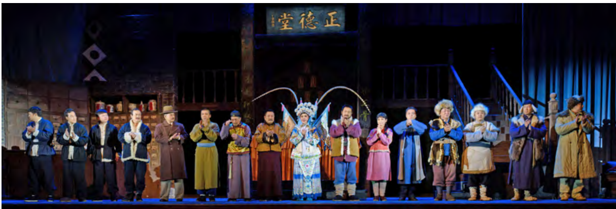
"The Secret Recipe" troupe of performers from Liaoning at Tun Ling Hall