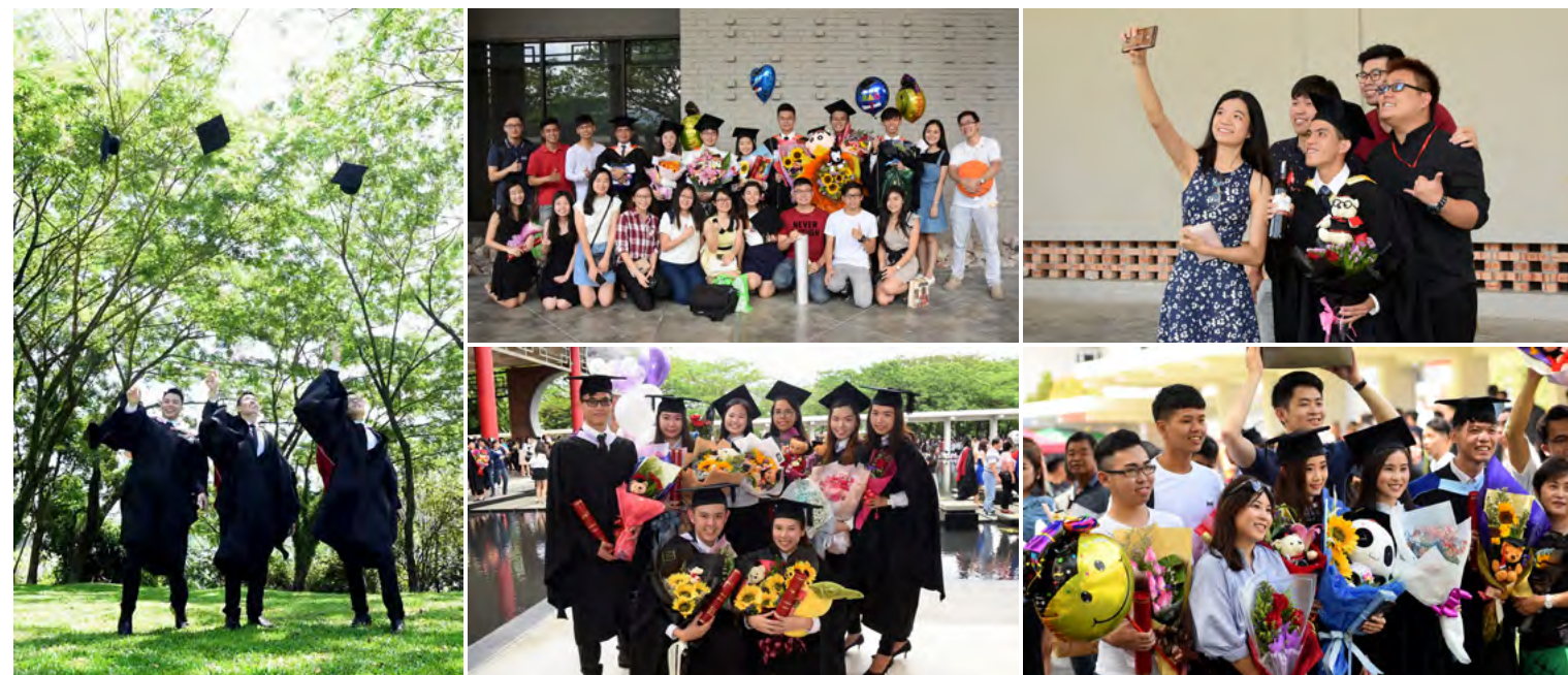
Graduates in jubilant mood