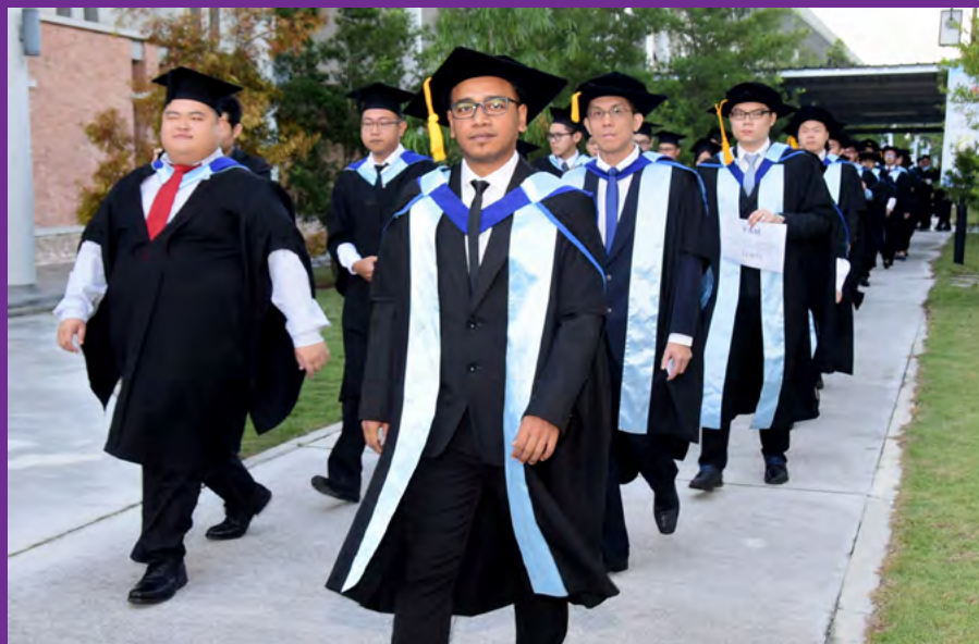
Graduands marching their way to Dewan Tun Dr Ling Liong Sik

UTAR welcomed a total of 2,914 new graduates into the family of UTAR alumni at the UTAR's 26th Convocation ceremony which was held from 9 to 11 March 2018 at the Dewan Tun Dr Ling Liong Sik of Kampar Campus. It was a celebration of the graduands' perseverance, determination and their dedication to the ideals of UTAR.