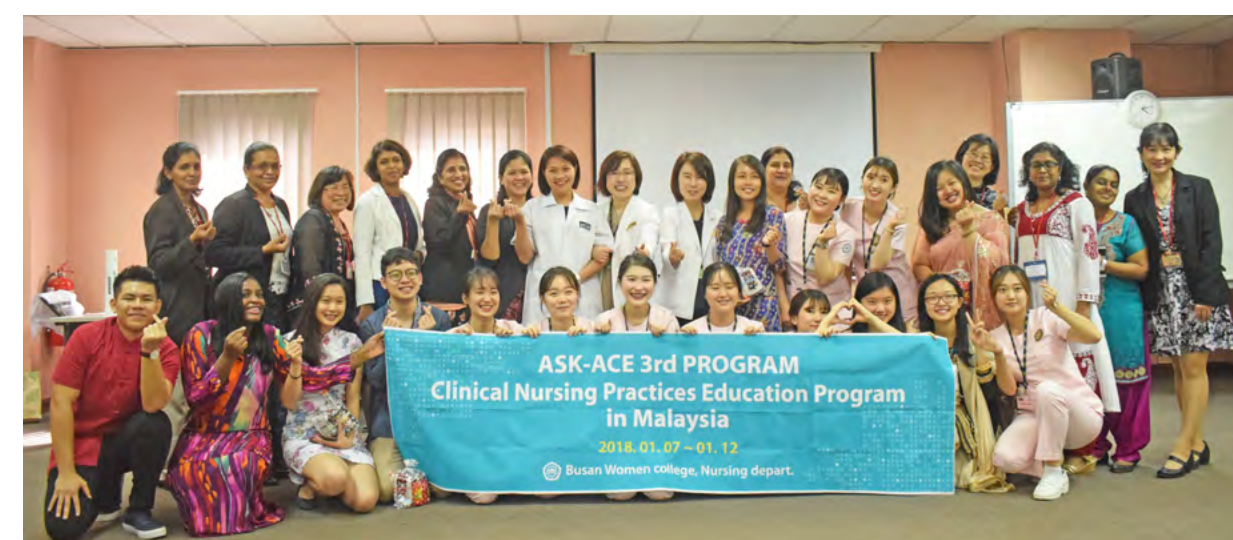
UTAR staff and the nursing students

UTAR also embarked on a collaborative journey with the Busan Women's College (Korea) by signing a memorandum of understanding (MoU). Both parties