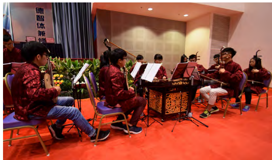
Chinese orchestra performance