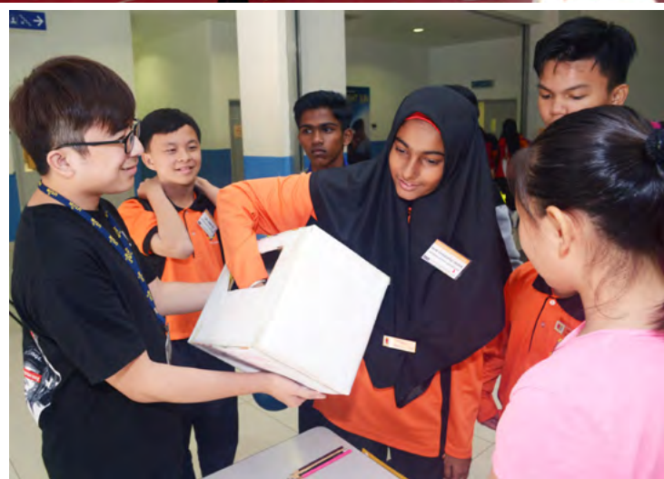
Antara aktiviti menarik yang dijalankan sepanjang Kem tersebut

Penguasaan bahasa Inggeris dalam kalangan pelajar sentiasa menerima perhatian daripada semua pihak dan ini sejajar dengan aspirasi sistem pendidikan di Malaysia yang ingin melahirkan individu yang mampu menguasai bahasa Inggeris bagi membolehkan mereka berdaya saing di peringkat global. Bagi mendukung aspirasi tersebut, Pusat Pendidikan Lanjutan UTAR (CEE) telah menganjurkan Kem Bahasa Inggeris yang disertai oleh 330 pelajar sekolah menengah pada 17 March 2018 di Kampus Sungai Long.