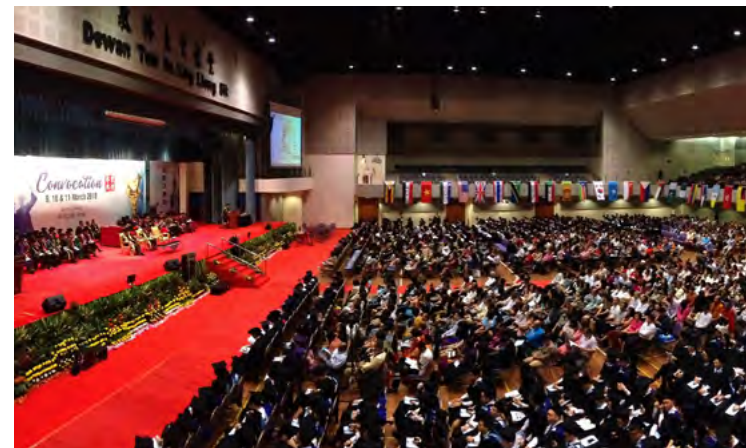
Graduands and their parents at the UTAR 26th Convocation