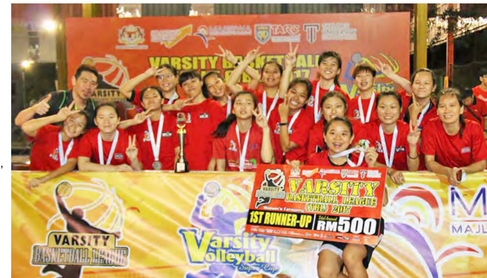
The first runner-ups posing with their medals and mock cheque