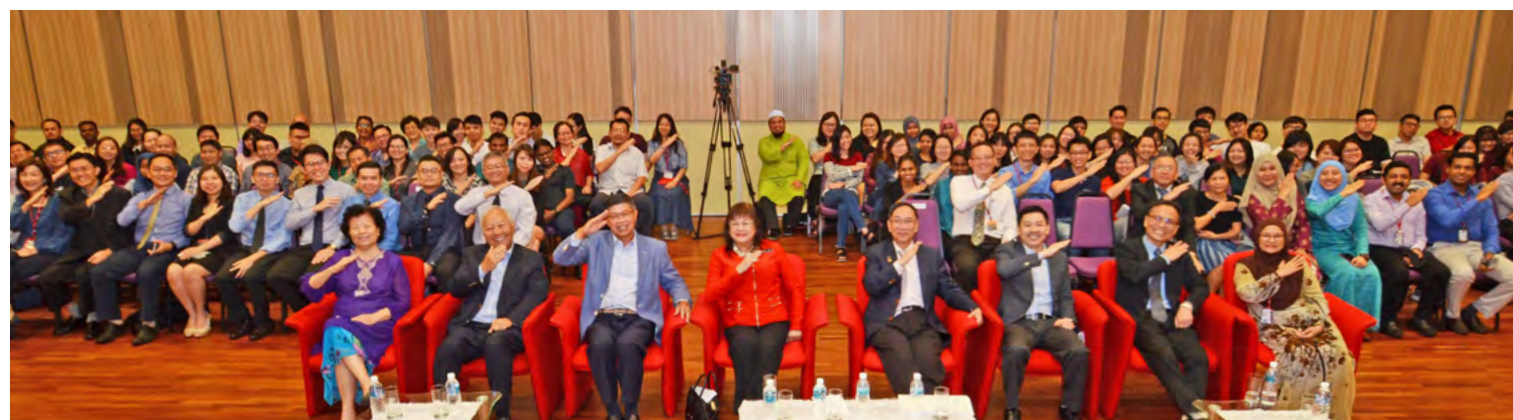
Group photo after the launch

With the support from Silverlake, UTAR launched the Key Generation of UTAR integrated Cumulative Grade Point Average (iCGPA) and Blockchain Certification System. It was held at Sungai Long Campus on 9 February 2018.