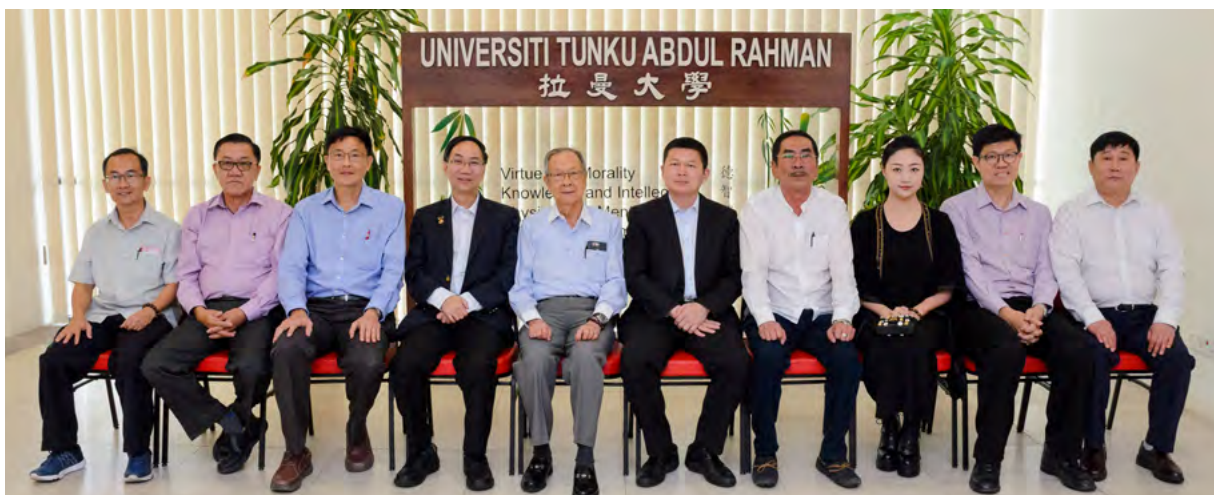
Delegates of the Trade Exchange Day