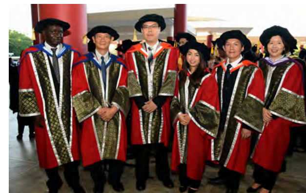
UTAR PhD graduates