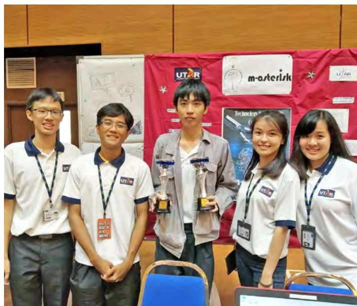
"M-Asterisk" won the Best Design and Best Idea awards

UTAR Psychology students from the Faculty of Arts and Social Science won the Best Design Award and Best Idea Award in the 2nd INTI PSYCHOMECH competition. It was held at INTI International University, Nilai on 6 and 7 April 2018.