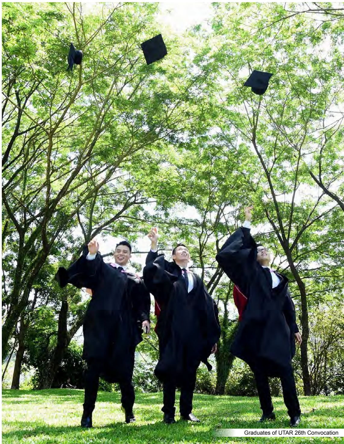
Graduates of UTAR 26th Convocation

• Broadening Horizons, Transforming Lives •