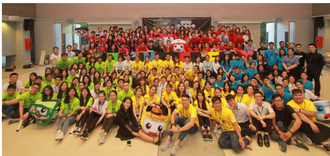
All smiles after the grand launch

"We are more than glad to continue to carry out these community-based projects and to do our best to serve the society. Our main goal is certainly to promote the public provision for unmet social