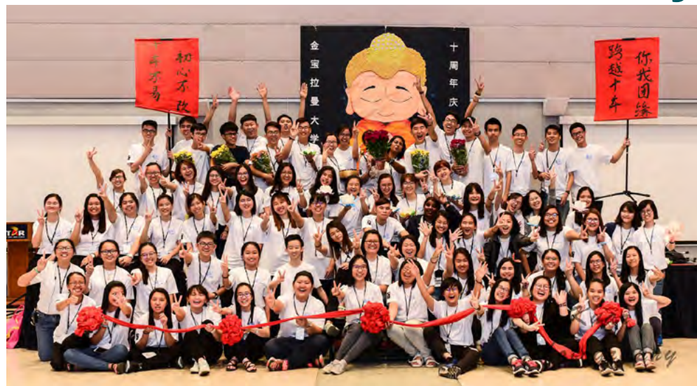
The Organising Committee of the UTAR Buddhist Society (Kampar Campus)

things around us, it is easier for us to control our mind regardless of how turbulent a situation can be."