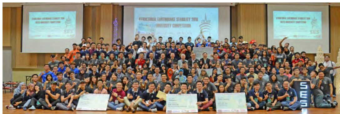
All the participating teams, organising committee and judges

The competition aimed to foster the future engineers with the ability to design buildings that could survive the natural disaster by providing them with the practical experience of earthquake engineering through a small-scale structural model. It also aimed to enhance their engineering knowledge, management skill, creativity and innovation.