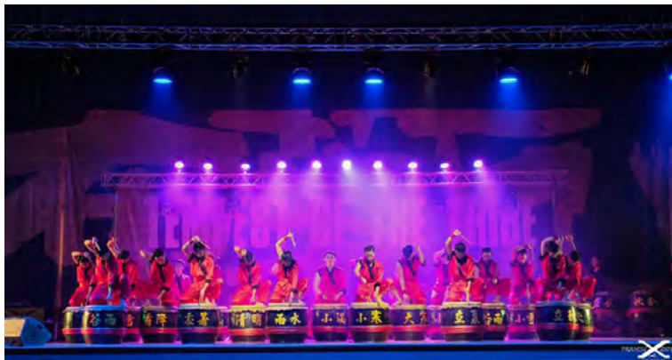
Koleksi persembahan yang amat memberangsangkan