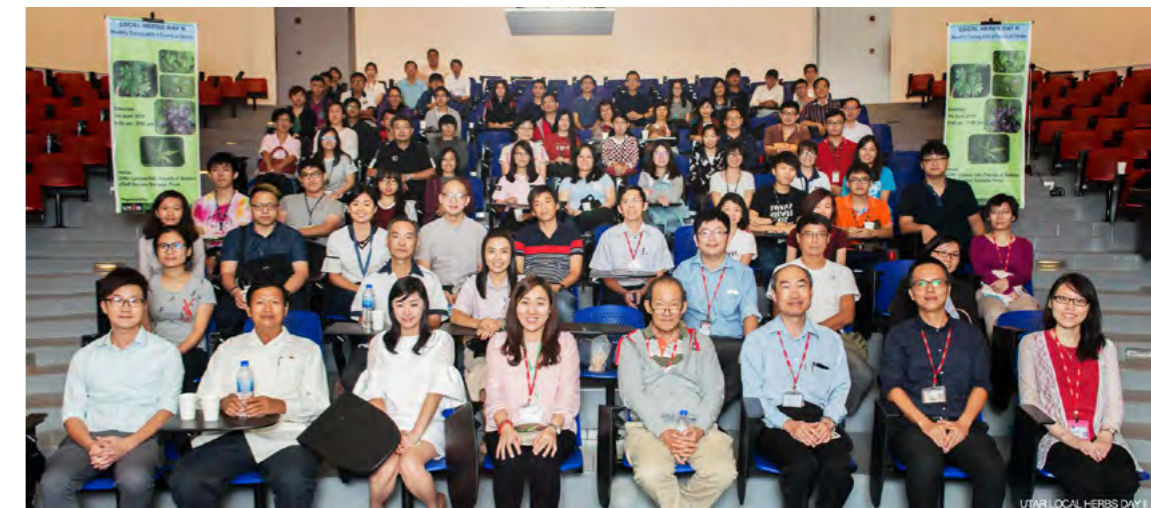
The organising committee, speakers and participants at Kampar Campus