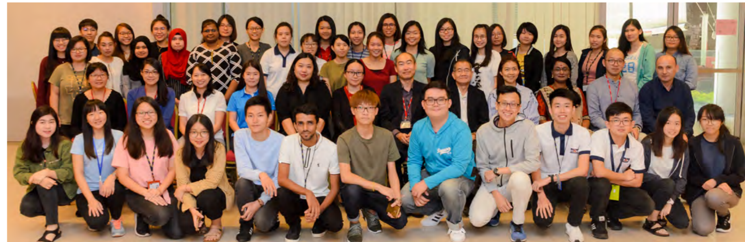
The speakers and participants at Kampar Campus

The Faculty of Science (FSc) organised "Food Safety Awareness Training" from 29 to 30 March 2018 at the Kampar Campus.