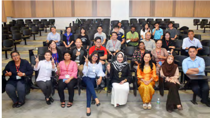
The talk saw some researchers, academic staff and postgraduates in attendance