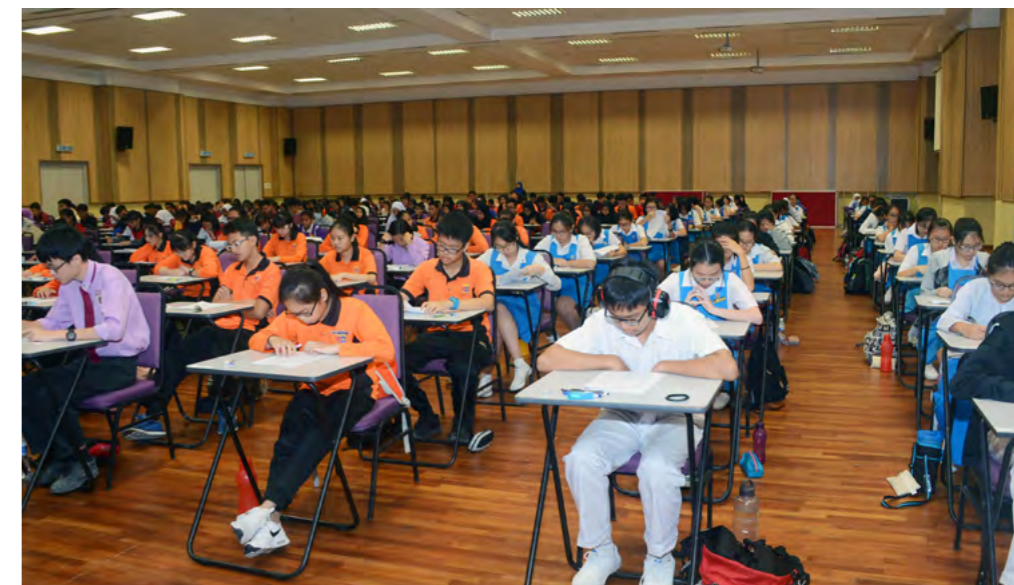
School participants during the competition

The competition was very challenging yet motivating."