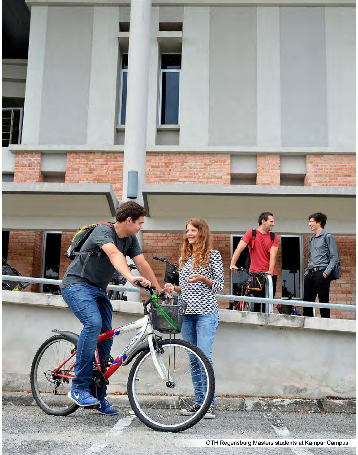
OTH Regensburg Masters students at Kampar Campus