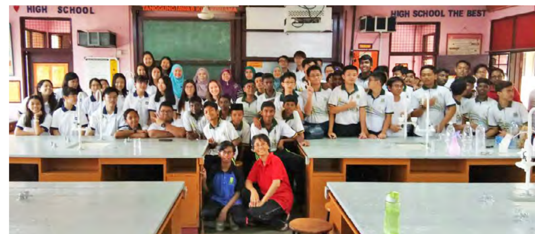
UTAR students with SMK Tinggi Klang students and teachers

than enriching the secondary school students' mind, the experience and knowledge that the students gained from this programme provided