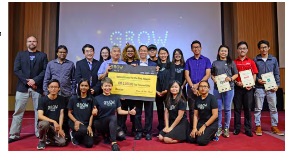
A donation of RM2,000 were raised by Grow in the Dark committee for NCBM

Under the subject MPU34032 Community Project, the Department of Soft Skills Competency of Sungai Long Campus collaborated with the Kuala Lumpur Engineering Science Fair to organise the STEM Mentorship Programme at SMK Tinggi Klang on 10 February, 24 February, 3 March and 31 March 2018.