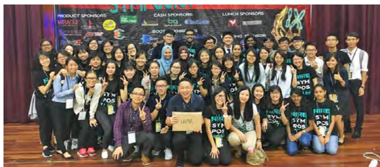
All smiles by the UTAR contingent

Three students emerged as winners in various categories at the 9th Malaysian Symposium of Biomedical Science (MYSYMBIOS). It was organised by the Department of Biomedical Science, Faculty of Medicine, University of Malaya (UM) from 12 to 13 May 2018, at the Balai Ungku Aziz, Faculty of Dentistry, UM.