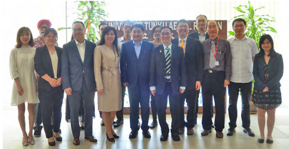
CAEIT and MDEC delegates with UTAR academics

as well as develop national-level strategic cooperation projects together. CAEIT also wished to join hands with UTAR in exploring the areas of Smart City, Artificial Intelligence, Network Security and Public Safety Research Centre.