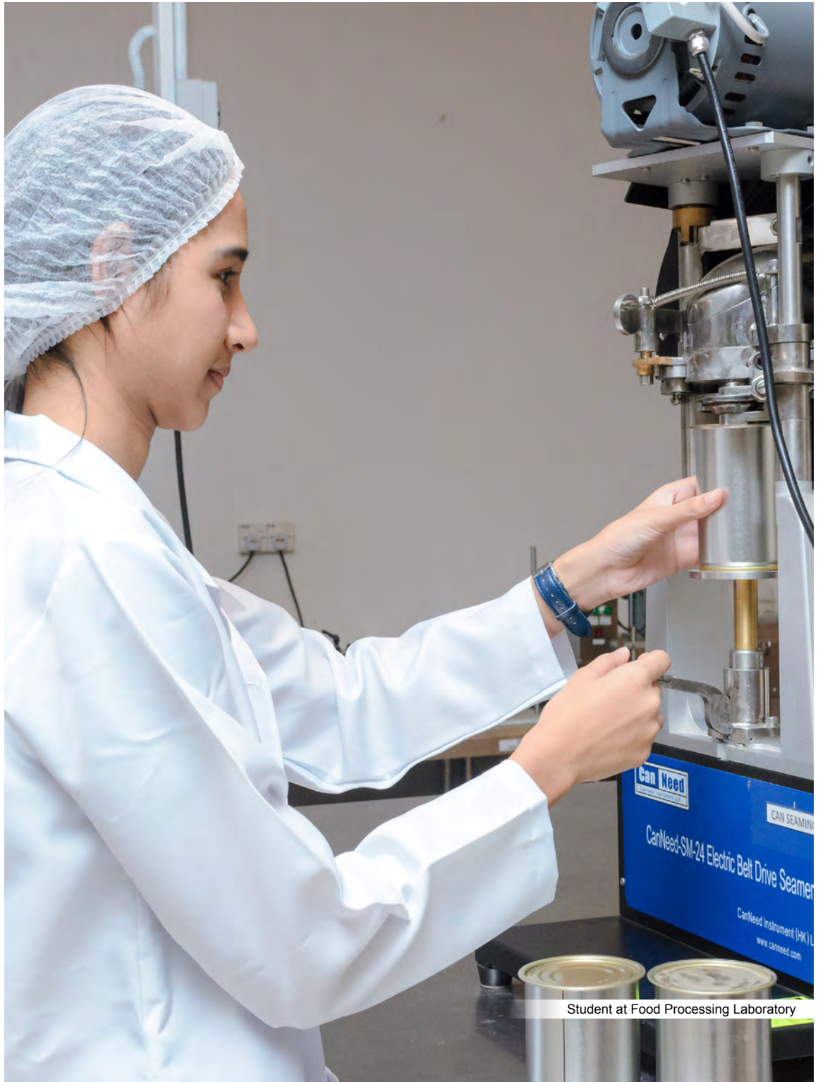
Student at Food Processing Laboratory