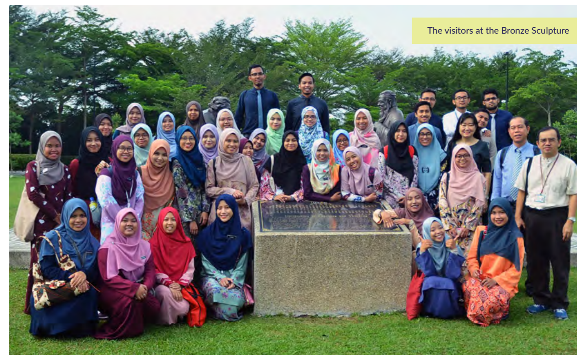
The visitors at the Bronze Sculpture