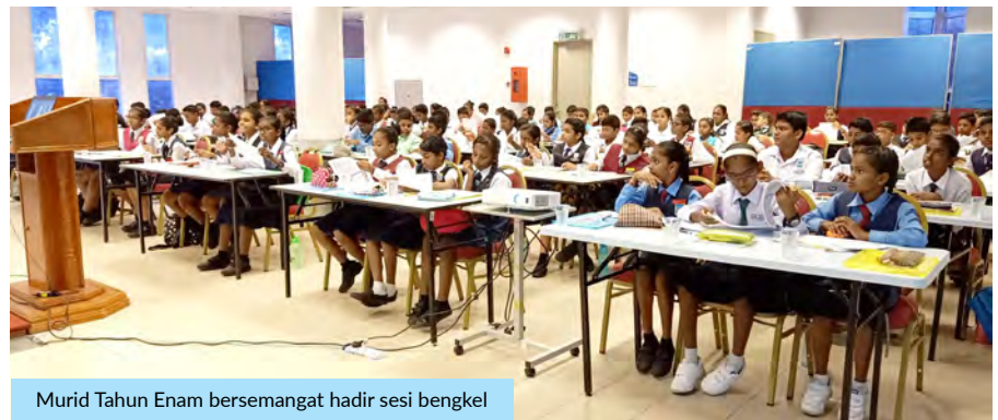
Murid Tahun Enam bersemangat hadir sesi bengkel

Selaras dengan objektif meningkatkan taraf pendidikan murid-murid sekolah rendah setempat, Bengkel UPSR CFS ini menumpukan kaedah komprehensif dan tumpuan sepenuhnya terhadap aspek kemahiran menjawab kertas peperiksaan dengan tepat serta teknik-teknik untuk mendapat markah tinggi. Tambahan pula, bengkel ini turut menitikberatkan kekuatan dan kelemahan mereka dalam sesetengah mata pelajaran tertentu. Bengkel dua hari tersebut turut merangkumi mata pelajaran seperti Bahasa Melayu, Bahasa Inggeris, Bahasa Tamil, Sains dan Matematik.