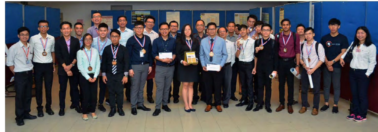
The winners with guests, FEGT staff and other participants

The ninth Faculty of Engineering and Green Technology (FEGT) Final Year Project (FYP) Competition, co-organised by FEGT and IEM Student Section Kampar Campus was held on 10 April 2019 at Kampar Campus. It saw the participation of 105 posters from five departments, namely Construction Management, Electronic Engineering, Environmental Engineering, Industrial Engineering, and Petrochemical Engineering.