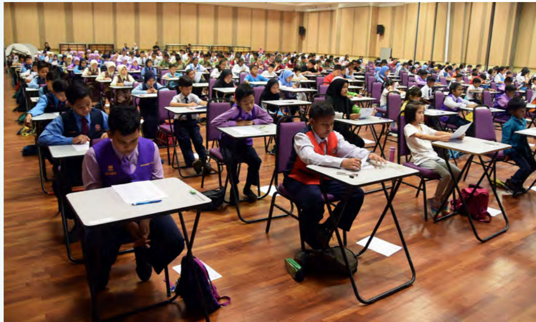
▲ The competitions saw the participation of more than 90 schools, colleges, universities, centres and kindergartens from various parts of the country

The Mind Competitions consisted of three main categories, namely Memory Competition, Mind Mapping Competition and Mental Calculation Competition. The competitions were open to all ages from pre-school