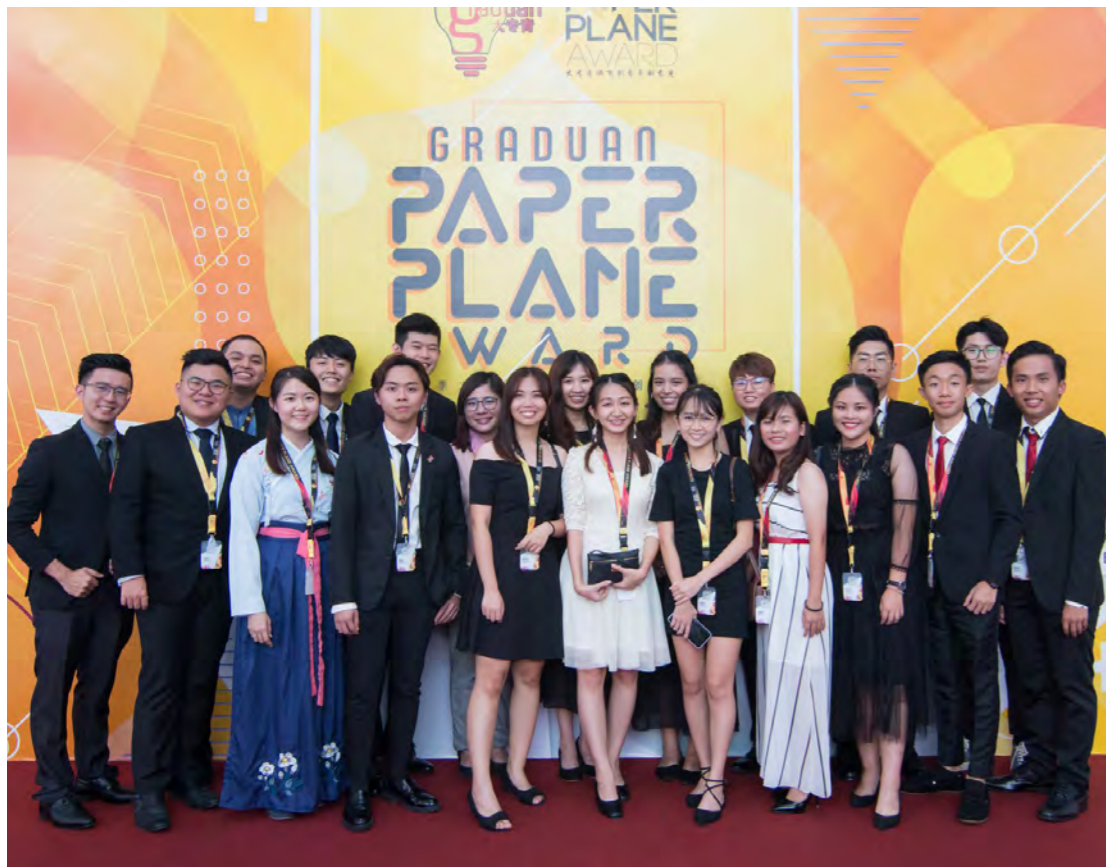
CCN 2017 Organising Committee and their advisors at the award ceremony

The "Eternal Chinese Cultural Night 2017" (CCN 2017) event by Chinese Language Society (CLS) of Kampar Campus won "Creative Marketing Project Award" by GRADUAN Paper Plane Award at Wisma Hua Zhong, Seri Kembangan, Selangor on 18 May 2019. CLS walked away with a trophy and a certificate.