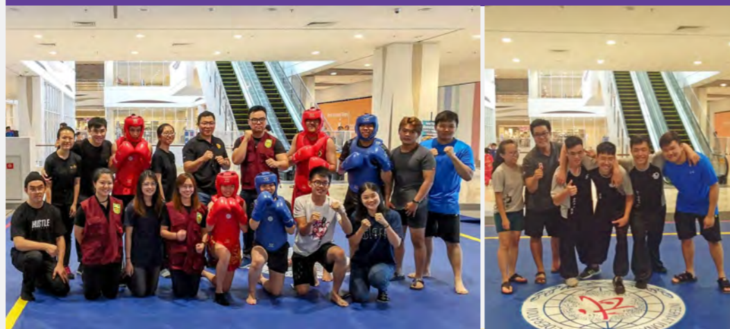
▲ UTAR Sanda squad (left pic) and UTAR Taichi squad