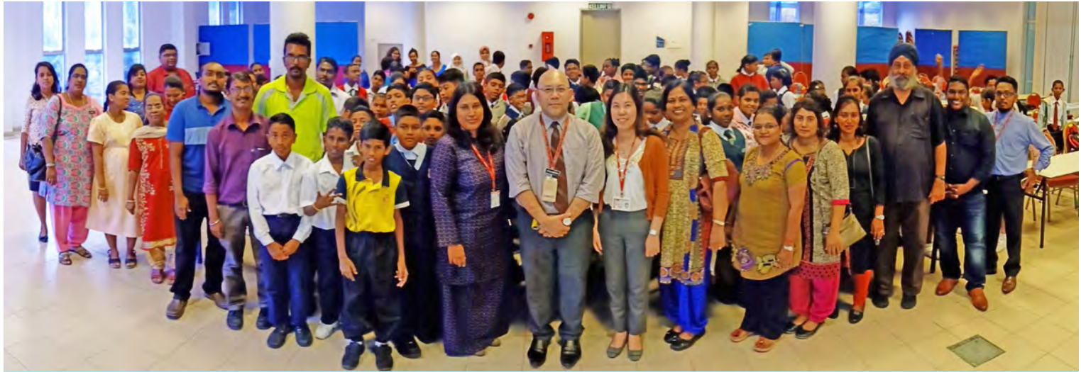
▲ Para peserta, guru-guru sekolah dan kakitangan UTAR semasa majlis penutupan bengkel

Pusat Pengajian Asasi (CFS) UTAR Kampus Kampar dengan kerjasama Persatuan Bahasa dan Kebudayaan India (ICLS) UTAR telah melancarkan sebuah program pendidikan bertajuk “Bengkel Ujian Pencapaian Sekolah Rendah (UPSR) CFS” khususnya untuk pelajar-pelajar Sekolah Jenis Kebangsaan (Tamil) bertempat di Kampus Kampar UTAR.