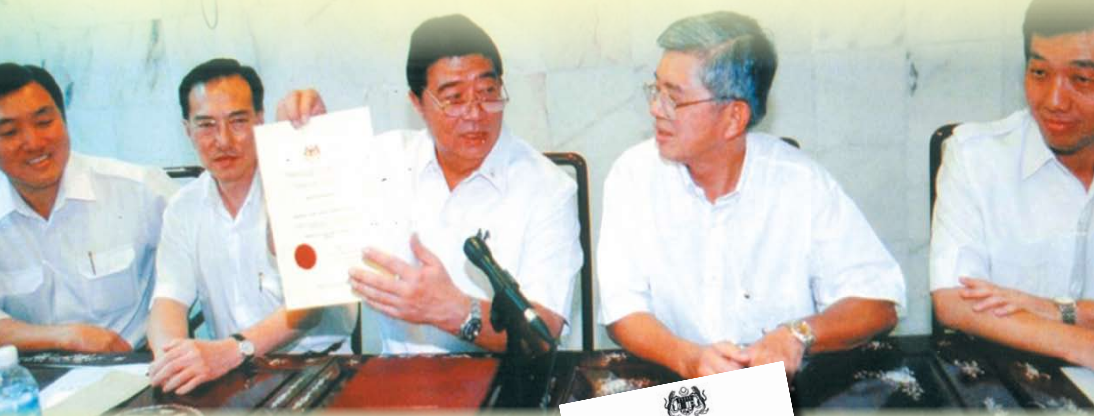
Dr Ling showing the offer letter from the Education Minister