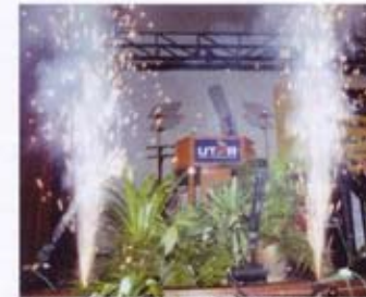
Fireworks & coloured confetti raining on the stage ...