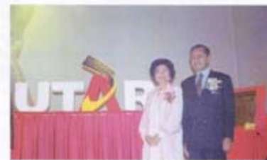
The Prime Minister and his wife next to UTAR's logo.