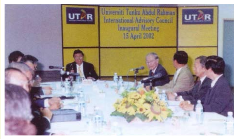
The inaugural IAC meeting