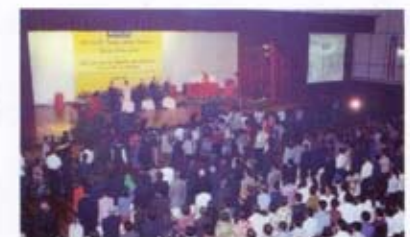
The assembly standing for the National Anthem.