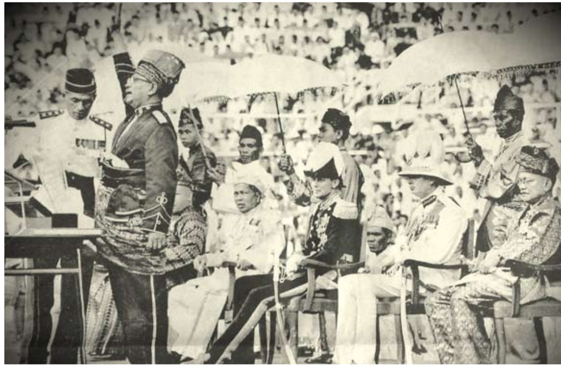
Tunku Abdul Rahman announcing the independence of Malaya on 31 August 1957 at the Merdeka Stadium

M erdeka!" shouted YTM Tunku Abdul Rahman Putra Al-Haj ibni Almarhum Sultan Abdul Hamid Halim Shah (1903-1990), just hours after becoming the first Prime Minister of the Federation of Malaya. He paused for the crowd, more than 20,000, who packed the newly completed Merdeka Stadium on the morning of 31 August 1957, to join him, and continued "Merdeka!" for six more times proclaiming the country's independence from the British. Little did anyone know then that within five decades later two of the country's most popular institutions of higher education would be named after a prince and Malaysia's first Prime Minister (1957-1970), Tunku Abdul Rahman.