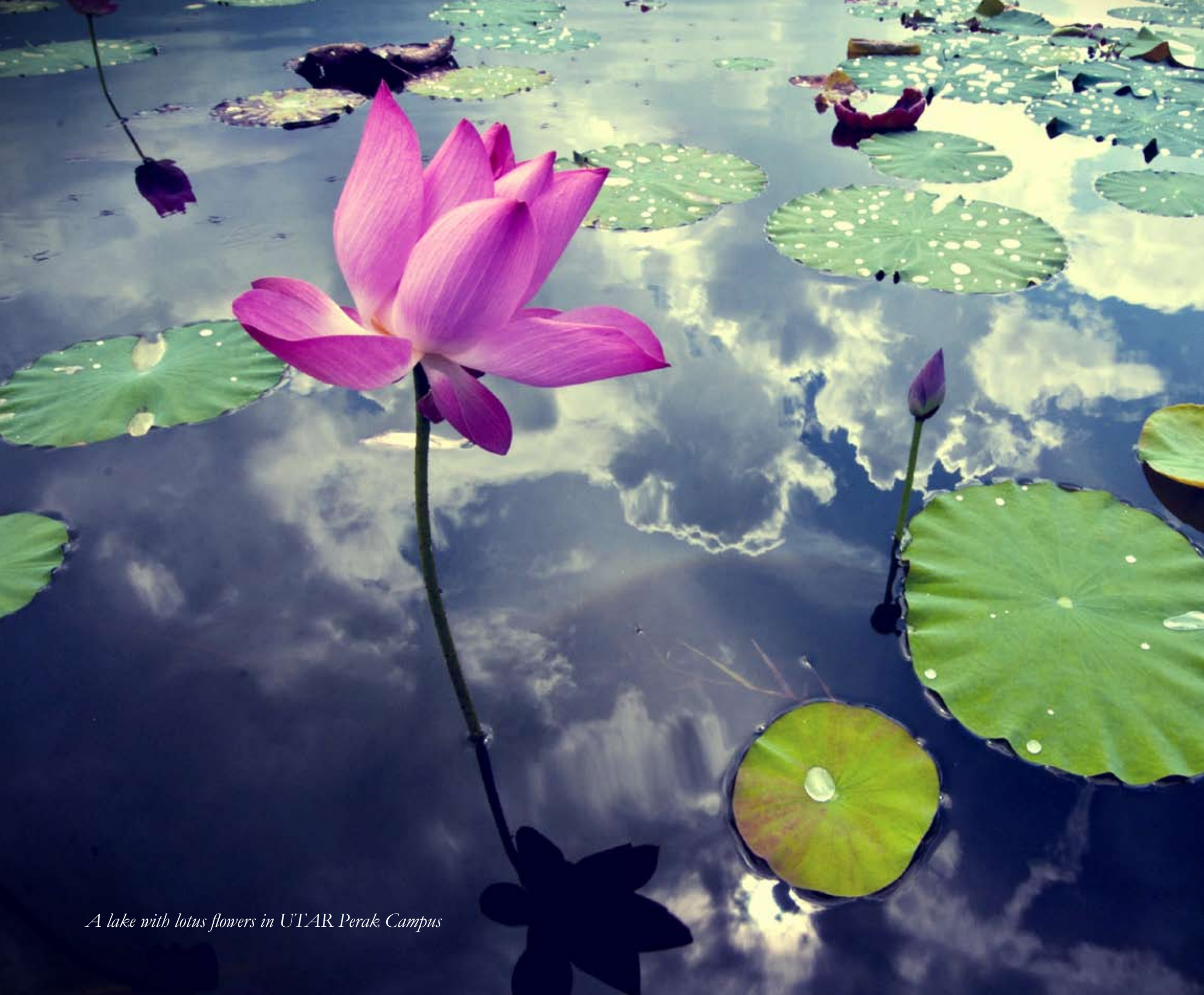
A lake with lotus flowers in UTAR Perak Campus