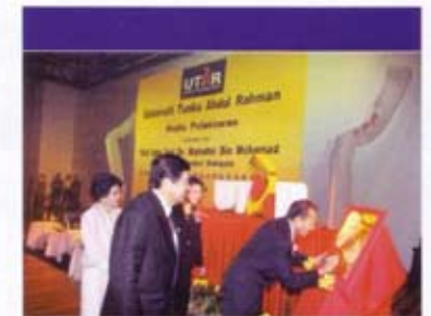
The Prime Minister sealed the launching ceremony by signing on the plaque.