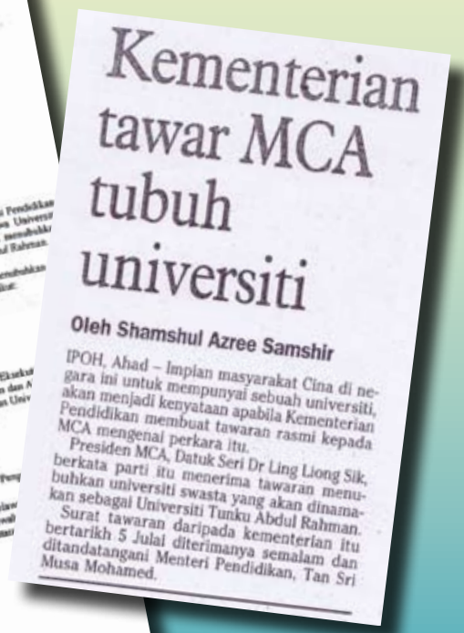
Berita Harian, 9 July 2001