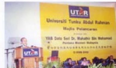
The Prime Minister delivering his Inaugural Lecture.