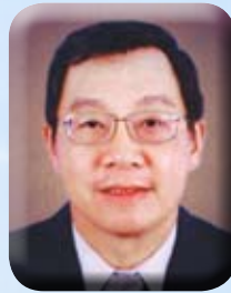
YB Tan Sri Datuk Seri Dr Fong Chan Onn