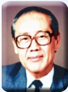
YBhg Professor Dato' Wang Gungwu Chairman

Chairman of East Asia Institute at the National University of Singapore and former vice-chancellor of the University of Hong Kong (1986-1995).