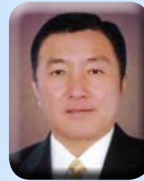
YB Dato' Seri Ong Ka Chuan