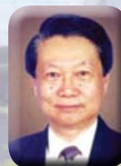
YBhg Professor Emeritus Dato'

Former President of Academia Sinica, Taiwan, Renowned Chemist and co-winner of the Nobel Prize in Chemistry 1986.