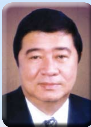
YABhg Tun Dr Ling Liong Sik