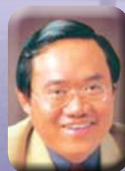
YBhg Professor Tan Sri Datuk

Creator of Mind-mapping and a leading author on brain power