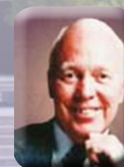
Mr Tony Buzan

Former Chairman of the House of Lords, UK Parliament and former rector of Imperial College (1993-2000), UK.