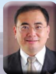
YB Datuk Ir Dr Wee Ka Siong