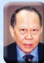
YBhg Academician Professor Emeritus Tan Sri Datuk

Chancellor of Nottingham University, UK and former president of Fudan University, China.