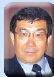
Professor Tu Weiming

Chairman of East Asia Institute at the National University of Singapore and former vice-chancellor of the University of Hong Kong (1986-1995).