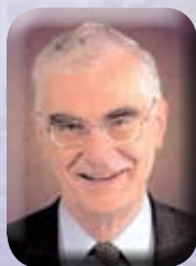
Lord Ernest Ronald Oxburgh

Professor and chair of the Department of Microbiology, the University of Malaya, Malaysia