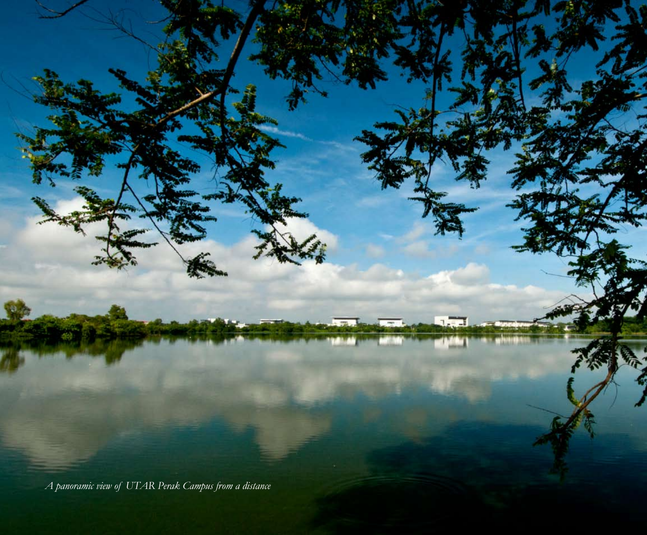
A panoramic view of UTAR Perak Campus from a distance