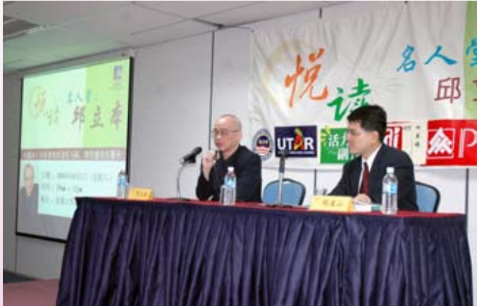
About a Flat World