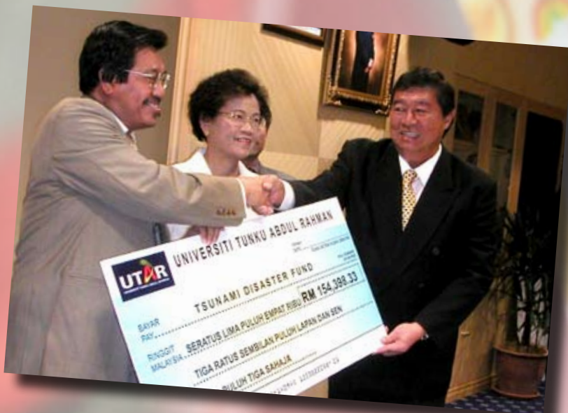
In aid of the Indian Ocean Tsunami victims in 2004