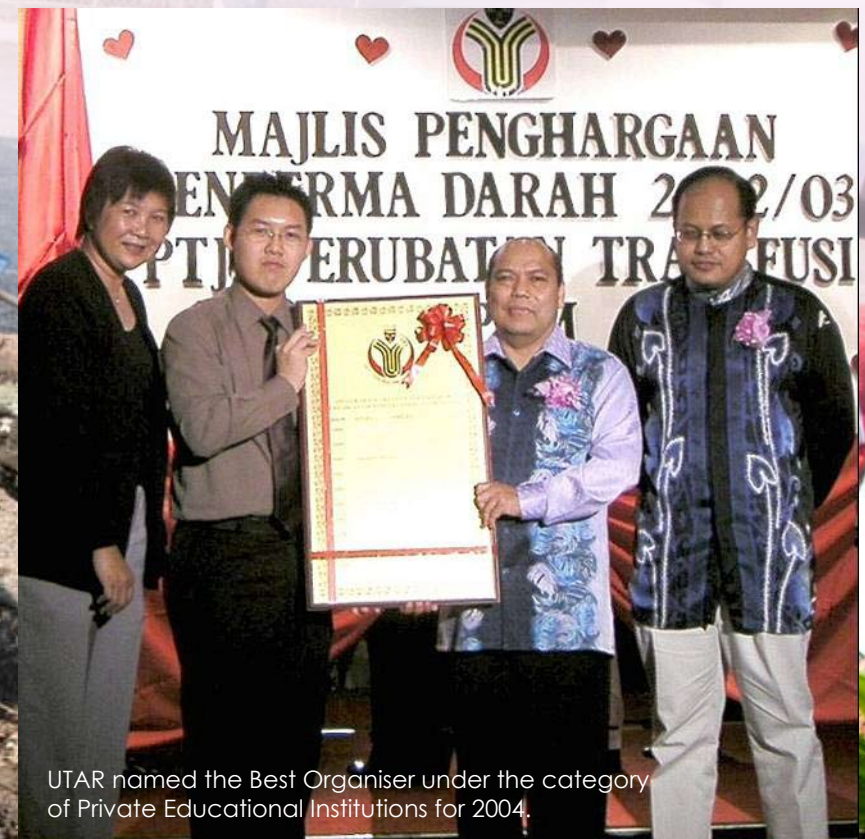
UTAR named the Best Organiser under the category of Private Educational Institutions for 2004.