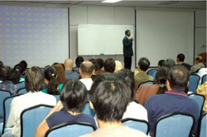
About the Magic of Memory