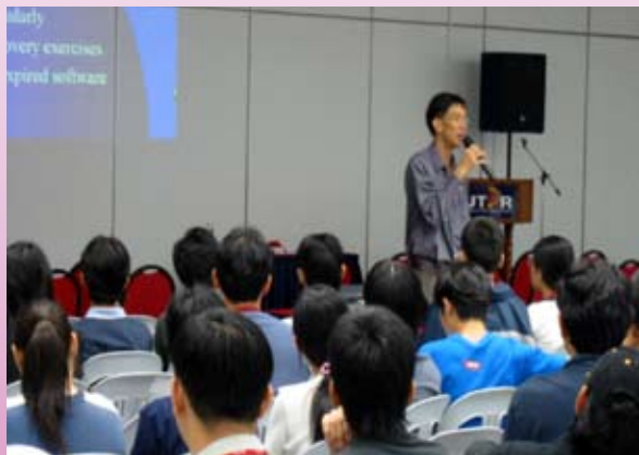
About Internet Security