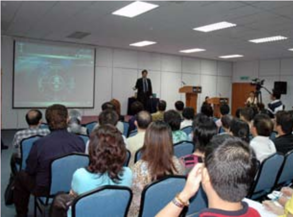
About Feng Shui