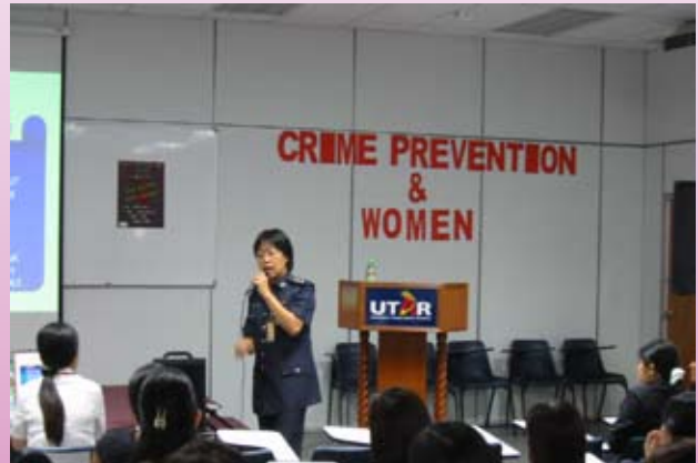
About Crime Prevention