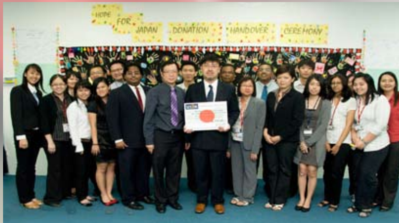
In aid of the Tsunami victims in Japan in 2011

As part of its responsibility to give back to society, UTAR assists in reducing the plight of victims of natural disasters both within and outside Malaysia. UTAR students and staff promptly responded to the call to provide humanitarian assistance to such victims. To name a few, there were fund-raising campaigns in aid of war-hit Iraqis civilians in 2003, Tsunami victims in 2004, victims of Cyclone Nargis in Myanmar in 2008, victims of Sichuan earthquake and "Hope for Japan" fund-raising campaign for Earthquake and Tsunami victims in Japan in 2011.