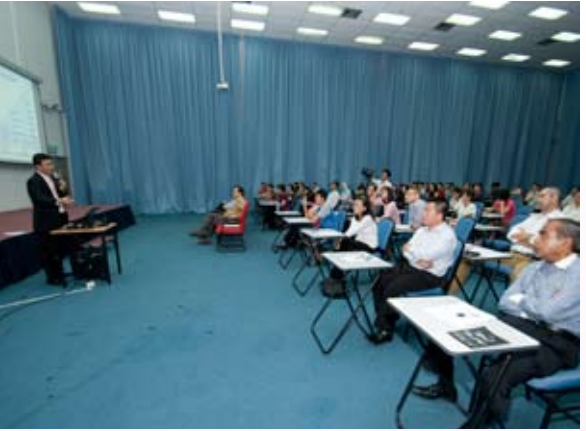
About Emotional Intelligence