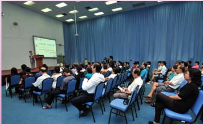
About Traditional Chinese Medicine