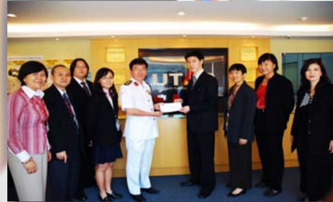
In aid of the Cyclone Nargis victims in Myanmar in 2008