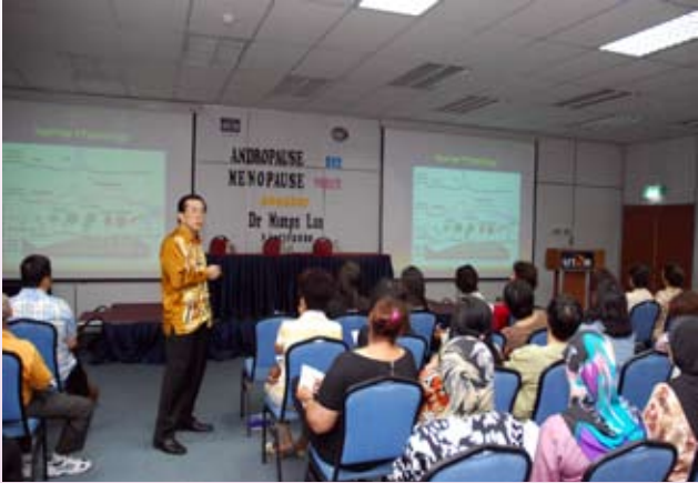
About Andropause and Menopausie